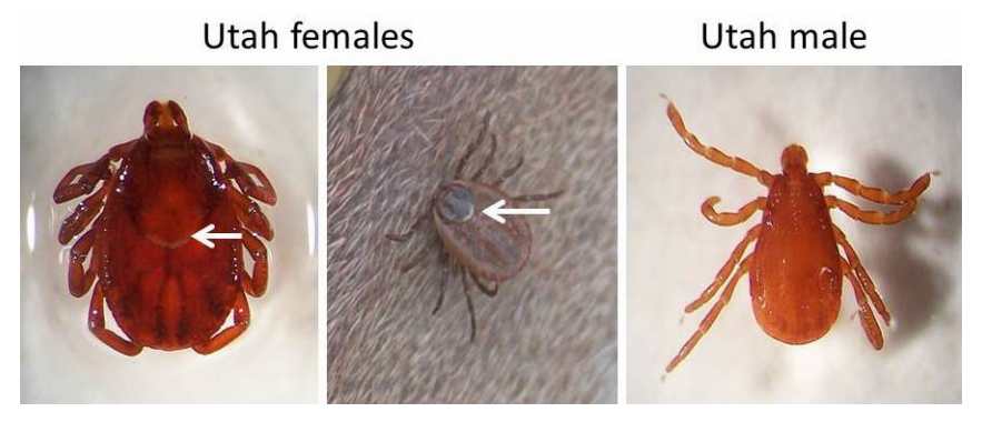
FIGURE 1. Scant gray ornamentation seen on Utah specimens of Dermacentor parumapertus.

Seventy-four adult D. parumapertus ticks (21F, 53M) were removed from 8 black-tailed jackrabbits in central Utah, while 13 adult D. parumapertus (7F, 6M) were found on 4 jackrabbits in western Texas. Three of the Utah rabbits had no ticks on them, while others were heavily parasitized. Ticks were primarily found in the ears and on the head. As for ornamentation, the Utah specimens were barely ornamented. Females displayed only slight gray ornamentation near the posterior edge of the scutum and small spots of whitish-gray distally on the femurs of legs II, III, and IV; males were completely devoid of any ornamentation (Fig. 1). The description of female D. parumapertus ornamentation in Arthur's monograph (Fig. 2) almost exactly matches the pattern we observed in the Utah samples (Arthur 1960). In contrast, Texas specimens were richly ornamented in white. Females were brightly marked with white (not gray) on the scutum very similar to D. variabilis (Fig. 3), and had white spots distally on all femurs. Males from Texas were variously ornamented along the posterolateral margins of the scutum and displayed white spots distally on all femurs.