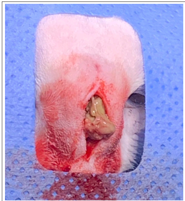
Figure 4 Incision into the mass effect on the dorsal nasal bridge resulted in exudation of thick mucoid material