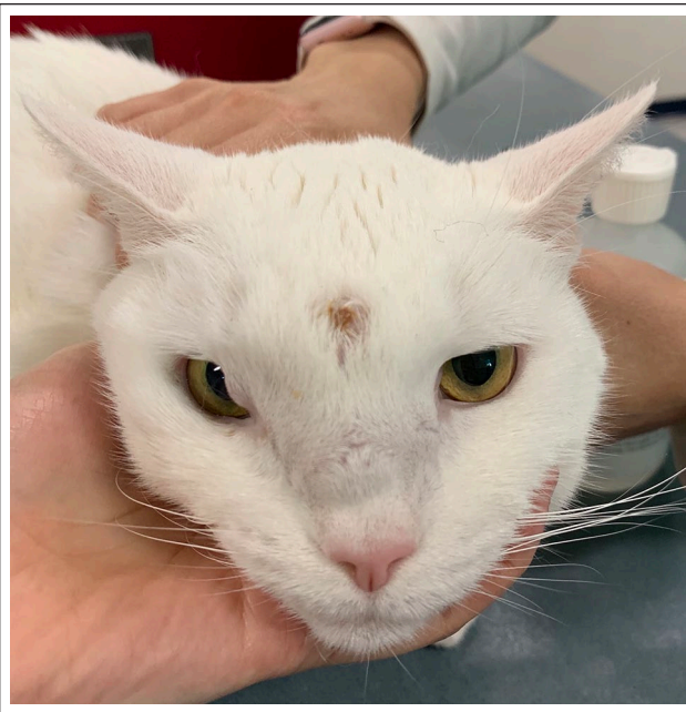
Figure 1 An 8-year-old neutered male domestic shorthair cat had marked widening of the nasal bridge with an oozing biopsy site centrally, facial distortion and an eyelid mass on the right upper lid on presentation to the Oncology Service

Two months prior to referral, nasal CT revealed a centrally hypodense, peripherally contrast-enhancing soft tissue mass dorsal to the bridge of nose, with a defect in the dorsal aspect of the maxilla and nasal bones. A biopsy was obtained externally from between the eyes and revealed severe necrotizing and suppurative inflammation. Bacterial and fungal cultures of the biopsy sample were negative. Fluconazole was initiated, but swelling of the nasal bridge progressed, the suture site began to ooze bloody fluid and a smaller lump developed on the right upper eyelid, prompting referral to the Oncology Service at UC Davis. Physical examination revealed marked widening of the nasal bridge with an oozing biopsy site centrally, facial distortion and an eyelid mass on the right upper lid (Figure 1). The remainder of the physical examination was within normal limits. Feline leukemia virus/feline immunodeficiency virus and repeat cryptococcal