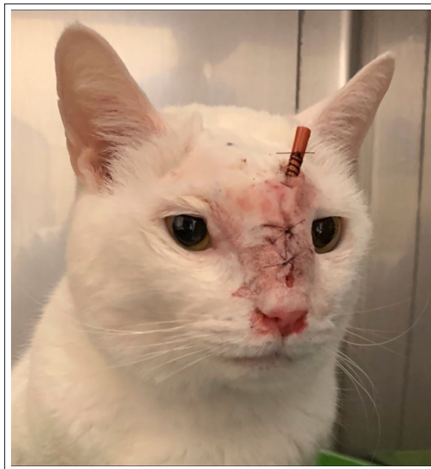
Figure 5 A 6 cm segment of a 5Fr red rubber tube was sutured into the cavity that resulted from debridement of inspissated material from the frontal sinuses

of 4-0 nylon. A 6 cm section of a 5Fr red rubber tube was placed transdermally into the cavity to allow venting of air and was affixed to the skin with a finger trap pattern using 3-0 nylon (Figure 5). Buprenorphine (0.02 mg/kg) was administered intramuscularly twice post-procedure for pain control.