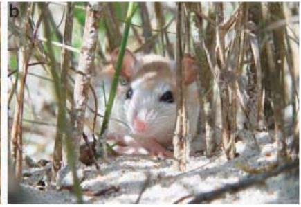
Dark, mainland oldfield mice such as the mouse on the left ( Peromyscus polionotus subgriseus ) are found in populations across the southeastern United States. Light beach mice ( Peromyscus polionotus phasma , right) blend into their native habitat on the Atlantic coast of Florida.

hundreds of decoy mice made of dark and light clay in matched and mismatched environments. Camouflage (crypsis) does work, they discovered. If the mouse had the same color as its background, its chances of avoiding detection increased 50 percent. The predators fooled by these clay models turned out to be about 50 percent terrestrial and 50 percent aerial.