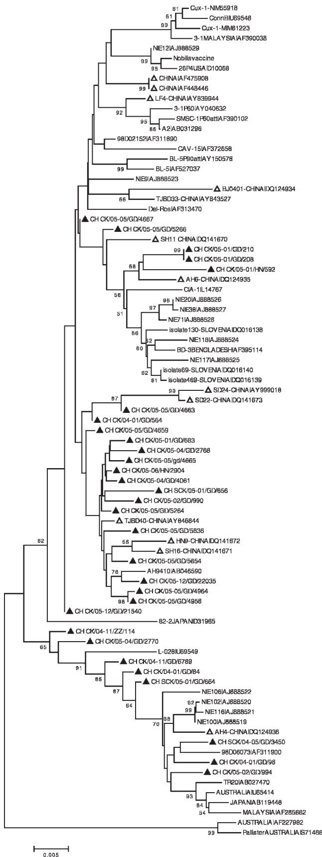
Fig. 1. Phylogenetic analysis of the nucleic acid sequence of 26 new complete CAV VP1 sequences from Guangdong and Hunan provinces, China, and 47 relevant complete VP1 sequences currently available on GenBank. The Nobilis ® P4 vaccine strain is also shown. Numbers at

Nucleic acid alignment and phylogenetic analysis. Ninety-three of 107 (87%) cloacal swabs from southeastern China were positive for CAV in the nested detection PCR. Sixty-five complete sequences