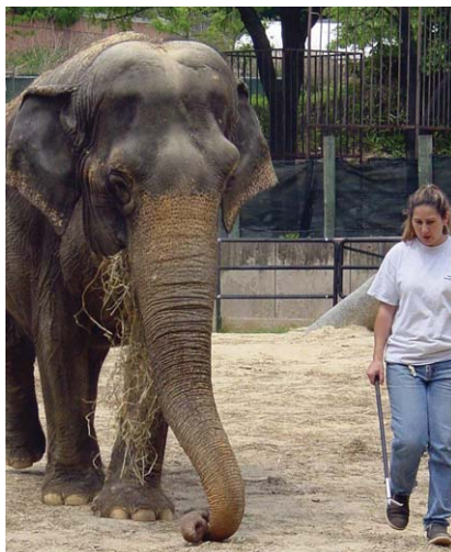
Keepers at the National Zoo in Washington, DC (pictured), and at other zoos around the country now walk their elephants daily to help prevent foot infections and to provide the exercise elephants need to remain healthy and alert.

Beyond walking their charges, most zoos now encourage natural behaviors. Keepers at the Reid Park Zoo in Tucson, for example, often hide treats around the elephant yard, forcing the animals to