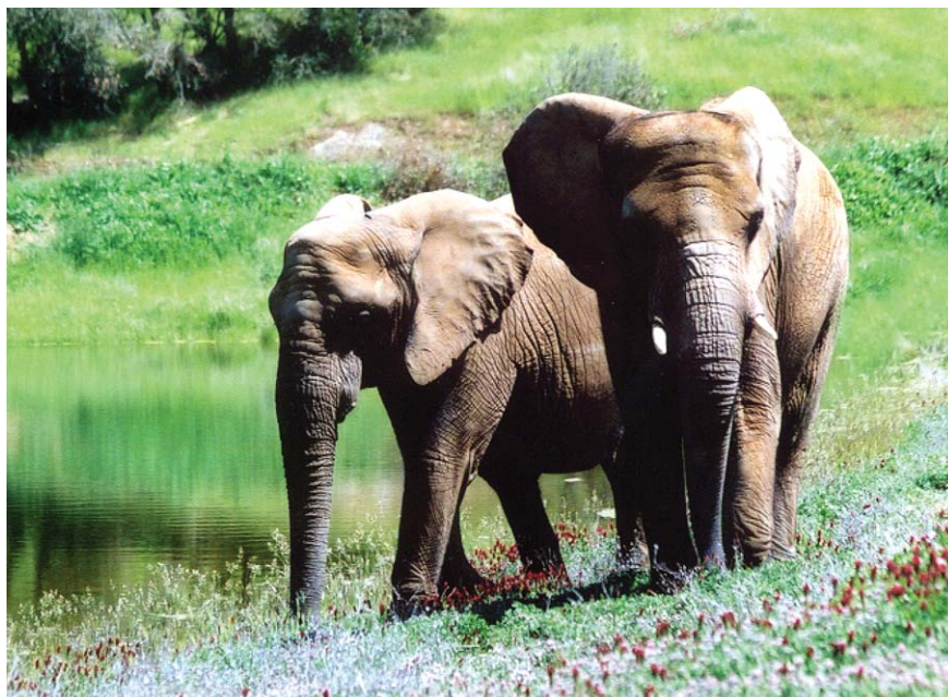
Pictured here are two of the eight elephants that roam more than 100 acres of open space at the 2300-acre Performing Animal Welfare Society sanctuary at San Andreas, near Sacramento, California. Here, their habitat includes forested hillsides, woodlands, open grasslands, and lakes similar to what some wild elephants encounter in Africa.

Another problem, animal welfare advocates say, is that too often baby elephants born in zoos are later separated from their mothers and sent to other zoos. Similarly, elephants that have lived together for years are sometimes split, especially if one is an African and the other an Asian elephant. Further, adult males are rare in zoos because they require separate and costly enclosures because of their size and aggressiveness. And too many zoos, especially those in northern climes, have indoor facilities with concrete floors and outdoor yards with compacted soils that foster foot infections. A foot infection forced the