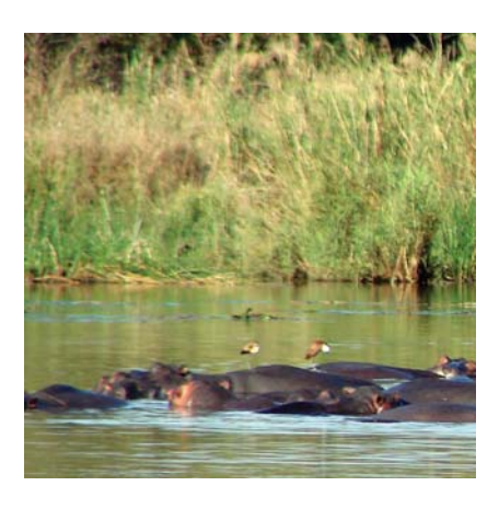
The Skukuza workshop, located near the banks of the Sabie River, evoked challenges, opportunites, aesthetic rewards, and scientific advances for freshwater protected areas. Here, at the nearby Lake Panic bird hide, a pod of hippos congregates and supports stationary birds.

While it may seem self-evident that protected areas, the foremost embodiment of conservation, would yield many opportunities for simultaneously safe-