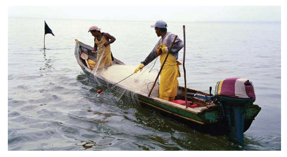
In the vicinity of the Patiño Reserve in Panama, artisanal fishers fish in the Gulf of San Miguel, in the Pacific coast's Darién Province. The government has restricted part of the Gulf of San Miguel to artisanal fishing and prohibits industrial shrimp trawling, although enforcement of the trawling ban is questionable. Sport fishing is allowed in another area of the Darién coast, where artisanal fishing activity is largely restricted.