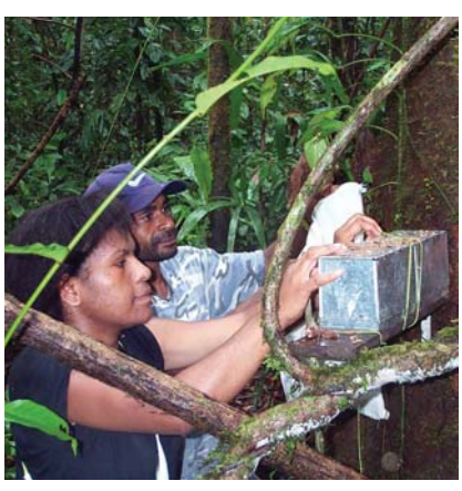
Students of the University of Papua New Guinea combine the collection of field data with computer statistical analysis during a field course in Herowana, in the Crater Mountain Wildlife Management Area (left) and at Gulf Province, Papua New Guinea (right). University courses, undertaken in partnership with the Wildlife Conservation Society, focus on field data collection, biological analysis, and technical report writing.

to notify and manage tiger reserves.... Such provisions are needed for all protected areas. However, there are also some aspects of the amendments that may undermine certain essential conservation provisions of the existing act, so these need to be reviewed."