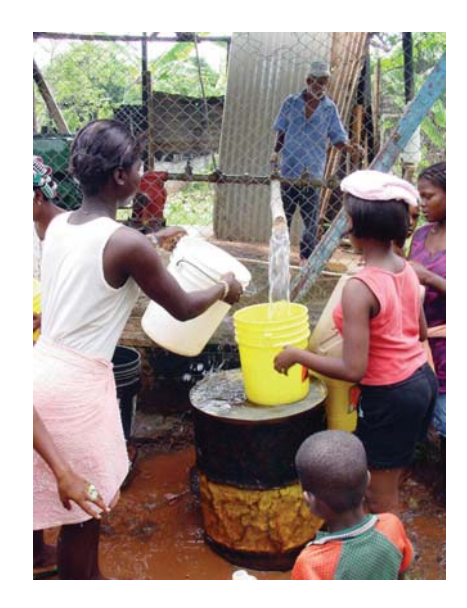
In Punta Alegre, locals have to collect pumped water several times daily. The coastal town is situated adjacent to the Punta Patiño Natural Reserve, which has cut Punta Alegre villagers off from their historic source of potable drinking water. The actual boundaries of the reserve are contested by native residents.

Another example is Punta Patiño, a private reserve owned by ANCON. Punta Patiño has rainforest and mangrove forests and is a Ramsar site (listed by the Ramsar Convention on Wetlands of International Importance). "The issues concern several communities adjacent to Punta Patiño," says Suman. Punta Alegre is an Afro-Caribbean fishing community of about 1000 people that borders the reserve. "Villagers claim that the lands where they used to cultivate crops are now claimed by ANCON as part of the reserve.... Moreover, there is no supply of potable water in the village." In addition, there are Embera Indian communities on the western side of the reserve, and