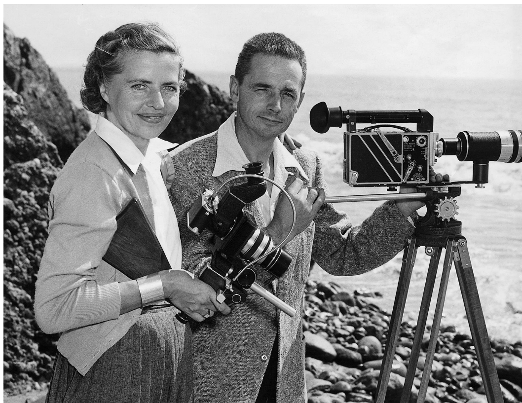
OLIN SEWALL PETTINGILL JR., 1907–2001

(Posing with Eleanor for publicity photo-shoot by Disney Studios in Santa Monica Beach, California, just prior to their departure for the Falkland Islands in October, 1953.)