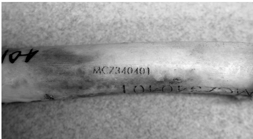
FIG. 2. Great Curassow ( Crax nigra ) MCZ 340401. Coracoid shaft marked by laser engraving. Note the traditional pen and ink numbering "401" that was applied over 100 years ago. The engraving "MCZ340401" is 8.5 mm long.

Recently, avian osteological material has served as a resource for research far removed