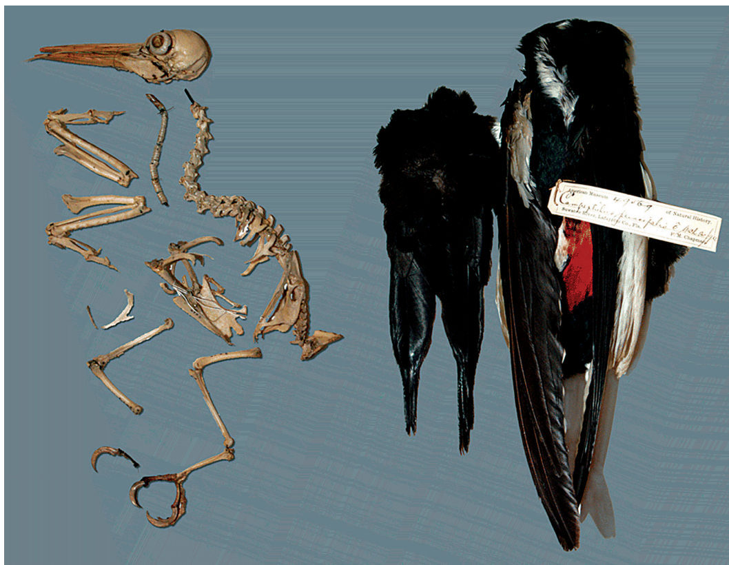
FIG. 2. Skeleton (AMNH 4708) and flat, folded dry pelt (AMNH 49569) of male Ivory-billed Woodpecker collected by Frank M. Chapman in Florida on 24 March 1890. Notice detached tail.

pattern, also allows for comparative study among members of Picidae, such as the sympatric Pileated Woodpecker ( Dryocopus pileatus ; Fig. 4).