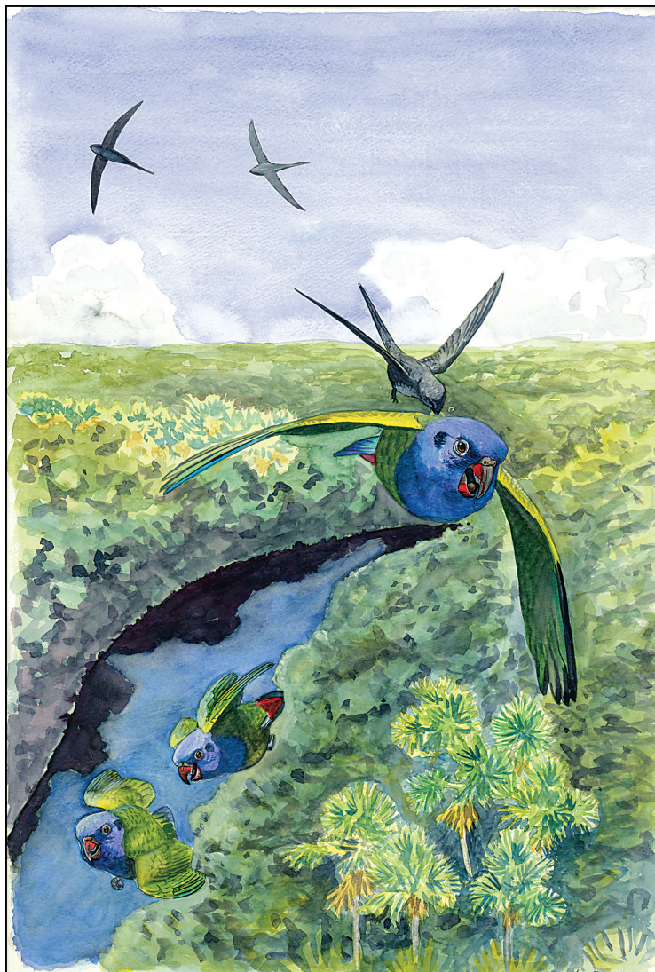
FIG. 1. A Fork-tailed Palm-Swift attacks Blue-headed Parrots ( Pionus menstruus ). Painting by Daniel F. Lane.

however, of being practically inaccessible to vertebrate predators, including primates and snakes. Construction of nests inside these dead palm leaves may have required the use of ultra-lightweight, flexible material with high insulative properties that could be structured with saliva. Feathers from other birds, especially those of pigeons and parrots, emerged as the evolutionarily ideal resource for these fast-flying, agile swifts. Indeed, many apodine swifts, in their very narrow wings and long, forked tails appear to be built for aerial piracy, which is remarkably convergent with frigatebirds ( Fregata spp.; Thomas and Balmford 1995), which obtain a fair amount of their food by chasing and out-maneuvering other birds.