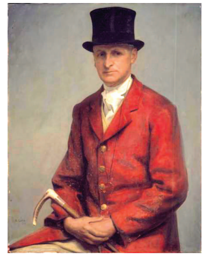
GREGORY MACALISTER MATHEWS was tall, bronzed, with silvery hair, blue eyes aided by a monocle, and a thin, prominent nose. He spoke rapidly in a high-pitched voice. He usually dressed as a country squire and is depicted thus in an oil portrait by Basil Gotto in 1929.

In one of the first papers on avian community ecology, Aretas A. Saunders (1884–1970) presented a study on the ecology of the breeding birds near Choteau, Montana (The Auk 31:200–210). At the time he was an employee of the U.S. Forest Service with primarily a desk job, but he conducted this research in the early morning, in evenings, on Sundays, and on holidays. His study area was about 245 acres (99 ha), and he mapped the distribution of all singing males and linked them to 5 habitat types. Saunders would go on to produce Birds of Montana in 1921, but by 1914 he had left the Forest Service and started teaching high school in Bridgeport, Connecticut, where he taught for the next 35 years. He continued his studies on avian ecology, mostly in the summer months, and authored a series of classic studies: The Summer Birds of the Allegany State Park, New York (1923), The Summer Birds of the Northern Adirondacks (1929), Ecology of the Birds of Quaker Run Valley, Allegany State Park, New York (1936), and Summer Birds