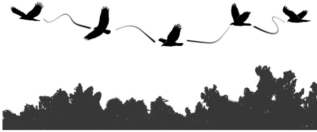
FIGURE 1. Illustration of a Turkey Vulture engaged in contorted soaring near tree height. The flight path, \sim 10 s in duration, deviates horizontally and vertically from a linear flight path while maintaining both altitude and general direction.

at intervals of \geq 5 min for our study. We paired behavioral observations with weather data by temporally interpolating weather parameters from the nearest meteorological station available (Table 1). Furthermore, at 15-min intervals we estimated cloud cover as clear ( < 20\% clouds), partly cloudy ( 20\text{--}80\% clouds), or overcast ( > 80\% clouds).