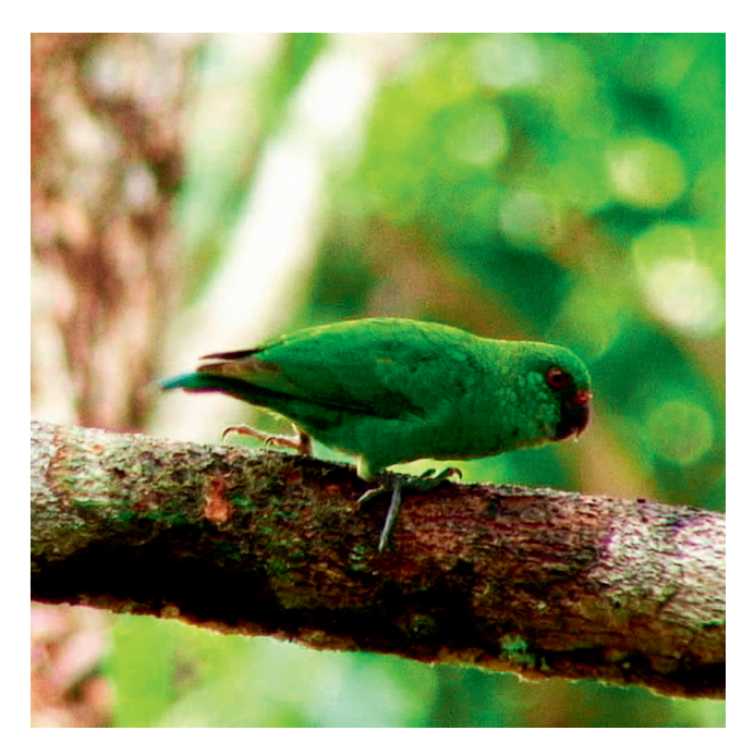
FIGURE 1. Finsch's Pygmy Parrot ( Micropsitta finschii ; also known as the Emerald Pygmy Parrot or Green Pygmy Parrot) is one of several parrots named for Finsch. This pygmy parrot inhabits tropical rainforests of islands in Papua New Guinea, the Solomon Islands, and the Bismarck Archipelago.

Survey in Washington, D.C., in 1904 and spent much of his career there working on economic mammalogy.