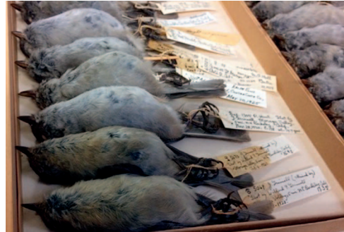
FIGURE 2. Museum of Vertebrate Zoology bird specimens nos. 40,391 and 40,392 (foreground), along with other Oak Titmouse specimens collected in the same region. After almost a century, the yellow of their breasts is faded but still quite noticeable.

Given the rarity of willow-pollen-covered bird undersides, how Grinnell's two birds achieved their adventitious coloration can still only be guessed at. Oak Titmice will use cavities in willows (Cicero 2000); these two could have used one cluttered with blown pollen or fallen catkins. An atypically early nest could have been lined with willow blossoms (locally abundant in February), rather than the more common oak blossoms (Cicero 2000), which are available starting in March (Fairley and Batchelder 1986). Bird nest collections, such as that started by Grinnell at the MVZ, tell us that both these