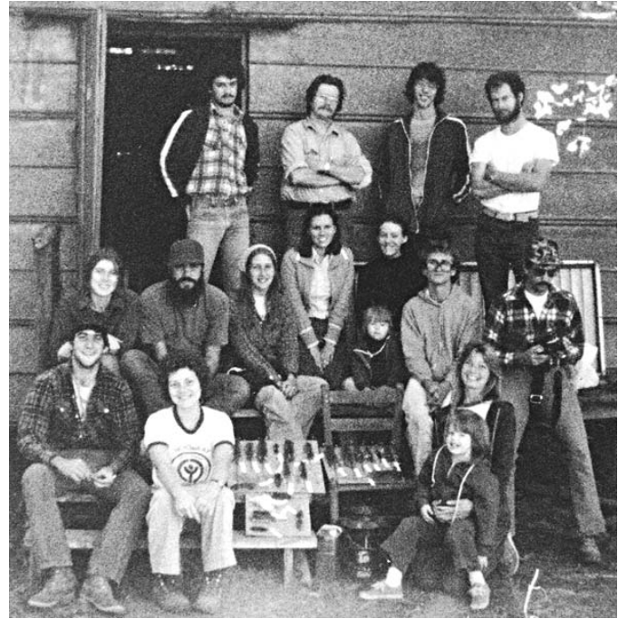
FIG. 2. —My 1st mammalogy class at Louisiana State University in 1979. At least 3 students in this class became professional field biologists, and there may have been others.

The increasing number and complexity of regulations. —Bureaucratic regulations, including foreign, federal, state, and local research permits; permits for collection, importation,