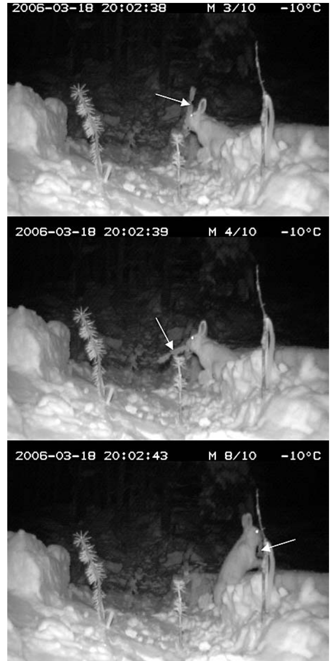
FIG. 3. —Snowshoe hare foraging behavior captured from motion-sensitive cameras installed at canopy gaps with giving-up density (GUD) experiments in eastern Canadian boreal conifer stands ( >90 years). Photographs show a hare clipping a large jack pine bough segment (indicated by arrows) in the gap and returning with it to forest cover.

Trade-offs between food and safety also can vary according to population density (China et al. 2008). Snowshoe hares display cyclical population dynamics (Krebs et al. 2001a), with up to 182-fold changes in density in some regions (Krebs et al. 1986). Wolff (1980) observed that snowshoe hares increased their use of open food-rich habitats and clipped deciduous twigs to larger diameters ( >1 cm) toward the peak phase of their cycle. The patterns of browse use observed in our study could vary according to the phase of the snowshoe hare cycle. Examination of furbearer harvest data suggests that snowshoe hare populations are cyclical in our study region