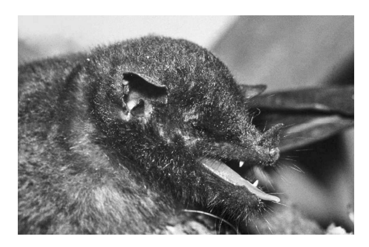
Fig. 1. —An adult female Choeroniscus minor from Rio Cuyabeno, Ecuador, collected in 1982 by E. Patzelt (Zoologisches Museum Hamburg, T 1380).

NOMENCLATURAL NOTES. The genus name Choeroniscus with minor as its type species was introduced in 1928 by Oldfield Thomas for the "normal headed species" that included minor , intermedia , inca , and godmani , thus separat-