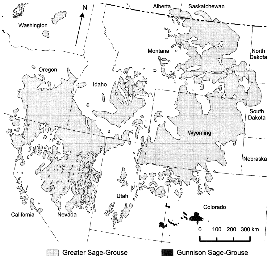
FIGURE 2. Current distribution of Greater and Gunnison Sage-Grouse in North America around the year 2000.

Arizona border (Huey 1939, Fig. 1). Phillips et al. (1964) considered the range of sage-grouse in Arizona to be hypothetical. The history of sage-grouse in southern Utah (Griner 1939, Lords 1951, Beck et al. 2003), and by extension northern Arizona, is poorly understood, due to the small number of travelers and early changes in habitat associated with settlement (Brown and Lowe 1980, Miller and Eddleman 2001). Rasmussen (1941:267) suggested that livestock grazing in northern Arizona was so severe in the 1870s and 1880s that the habitat was permanently altered: "Like most lowland sagebrush areas in the Great Basin, the associated grass species have almost all been destroyed by indiscriminate and unregulated grazing." Recent history has shown populations continuing to recede northward. For example, two recently extirpated leks in southern Utah were only 30 km north of the Arizona-Utah border (N. L. McKee, pers. comm.). In addition, sage-grouse have been ex-