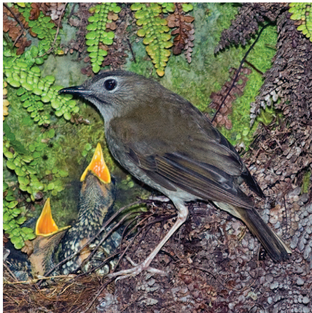
FIGURE 1. Puaiohi at nest with nestlings, Kawaikoi, Kauai, Hawaii, USA.

Mohihi, and Halepaakai (Figure 2). These sites range in elevation from 1,123 m to 1,303 m. The Koaie, Mohihi, and Halepaakai areas support relatively large numbers of Puaiohi, but Kawaikoi is on the edge of the species' range and supports only a few birds (Snetsinger et al. 1999, Woodworth et al. 2009). Wild Puaiohi were banded and studied previously in the Mohihi area from 1995 to 1998 (Snetsinger et al. 2005), and captive-bred Puaiohi were released at Koaie, Kawaikoi, and Halepaakai from 1999 to 2004 (Tweed et al. 2003, Woodworth et al. 2009), but we did not observe any of the previously marked or released birds at these sites during our study.