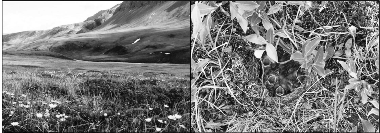
FIGURE 2. Smith's Longspurs were found nesting in open, low-shrub tundra in the Brooks Range, Alaska, USA (left). Nests were typically found in open areas with little variation in erect willow height and usually placed under a low shrub (most commonly an erect willow), under a graminoid clump, or on the side of a tussock or hummock (right).

= 21) of hummocks, and only 28% ( n = 24 ) were placed on level ground. Many nests also had clumps of graminoids (44%; n = 38 ) and shrubs (34%; n = 29 ) located directly over them (Figure 2), but shrubs were generally <30 cm high. Only 22% of nests ( n = 19 ) had no direct association with nest canopy vegetation. The most common shrubs associated with nests were erect willows, followed by ericaceous species ( Vaccinium uliginosum , Rhododendron spp.), and dwarf birches. Low shrubs (1.7–20.8 cm) were present at 88% of nests (Table 2). As expected, the mean elevation of nests in Atigun Gorge ( \bar{x} = 846 \pm 26 m) was higher than on Slope Mountain ( \bar{x} = 655 \pm 49 m). The slope of nest sites varied considerably, but tended to be steeper in Atigun Gorge ( \bar{x} = 4^\circ \pm 3^\circ ; range = 0–10°) than on Slope Mountain ( \bar{x} = 2^\circ \pm 2^\circ ; range = 0–9°). The aspect