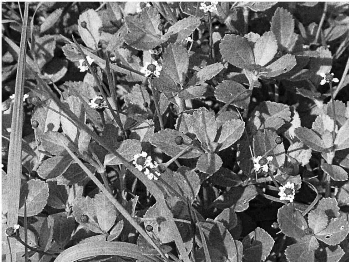
Fig. 1. Phyla nodiflora used as a larval food plant by the Phaon crescent.