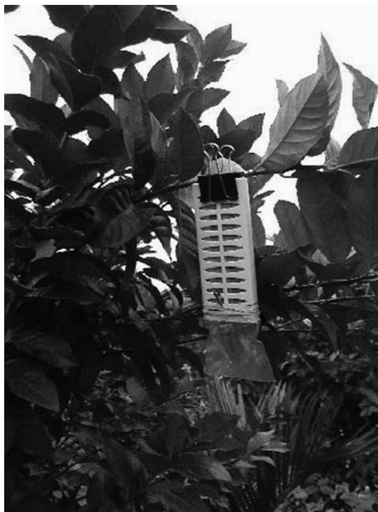
Fig. 2. Dichlorvos dispenser modification with blue stripe and sample collecting bag placed in the top canopy of a lemon tree in Neipu, Pingtung County, Taiwan.

Experiment 1. Taiwan (dry season). The experiment was conducted in a 0.6-ha lemon ( Citrus limon L., cv. Eureka) orchard for eight weeks from 26 November 2004 to 30 January 2005 in Neipu,