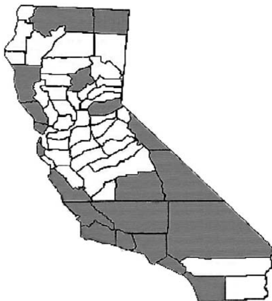
Fig. 3. Distribution of 3 phytoreovirus host plants in California, Madagascar periwinkle ( Catharanthus roseus ), New Zealand Spinach ( Tetragonia tetragoniodes ), and Cardinal flower ( Lobelia cardinalis ), occurrences shown in shading.

crops, where the GWSS occurs may prove important in the management of these and other emerging agricultural plant diseases.