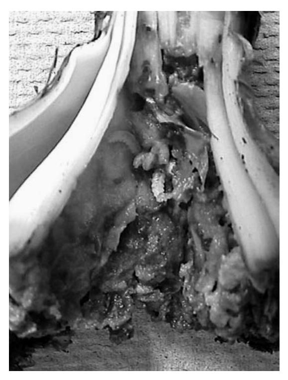
Fig. 3. Weevil larvae and heavy damage to an amaryllis bulb due to a high level of larval infestation.

pared with that obtained in the oviposition study (above) may be because eggs were dissected from the plant tissue within 24 h of oviposition (experiment 1) versus between 24 and 48 h of oviposition (oviposition study), respectively. Total time period from oviposition to adult eclosion averaged 47.4 \pm 3.7 d. Larvae stayed within the leaf tissue so number of instars was not determined. Late instars exited the tissue, moved into the vermiculite and became non-feeding prepupae. Of the larval developmental time, 9.9 \pm 2.9 d (range 3-16 d) were spent as prepupae. Newly eclosed, teneral adults were light brown in color and did not feed. It took an additional 3.8 \pm 1.1 d (range 1-6 d) for adults to become solid black and begin feeding.