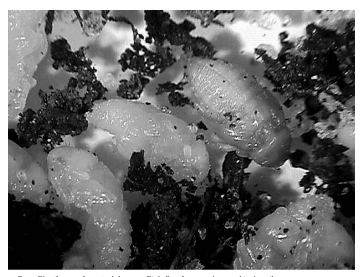
Fig. 4. Weevil pupae that exited the amaryllis bulb as larvae and pupated in the soil.