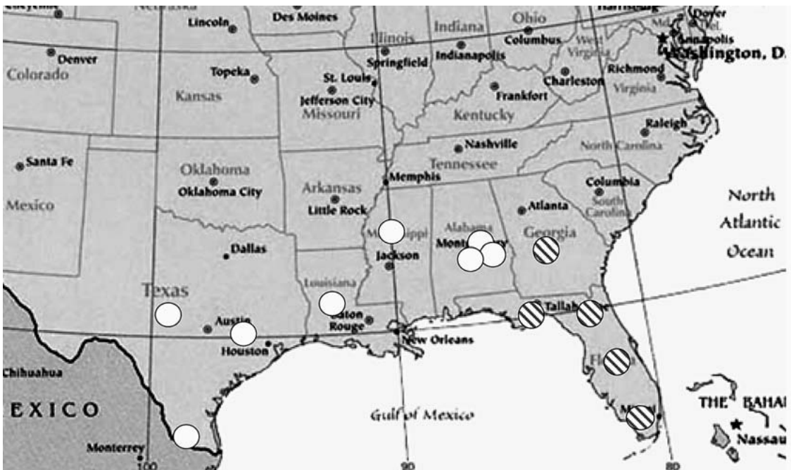
Fig. 3. Locations of the corn-strain fall armyworm haplotype profiles in selected states in the southeastern U.S. Circles with diagonal lines display the Florida profile, clear circles indicate the Texas profile. Data from Nagoshi et al. (2008).

The highly mobile and genetically diverse fall armyworm presents many technical challenges for studies on migration and population dynamics. Traditional methods of field observations, trap captures, and synoptic weather analysis have generally supported but only marginally added to the early estimations of fall armyworm migration (Luginbill 1928). However, relatively recent advances in molecular techniques make possible a far more detailed analysis of fall armyworm movements that begins to take into account the presence of genetically define subpopulations. In the near future, we anticipate mapping the annual migration of the corn-strain population throughout North America from their overwintering sites in Texas and Florida, and extending this analysis to compare the historical movements of the Brazil and Florida subgroups of this strain in the Caribbean, South America, and Central America. As more genetic markers are uncovered it may be possible to perform analogous studies on the rice-strain and interstrain hybrid populations to develop a more complete description of the migratory behaviors of this important agricul-