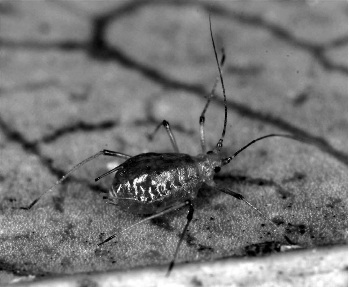
Fig. 2. Photograph of Aulacorthum corydalicola sp. nov. apterous viviparous female.

noecious holocyclic on Corydalis spp. However, it has not been determined where the summer generation survives, when the host plant loses leaves, and how the aphids overwinter on the host plant.