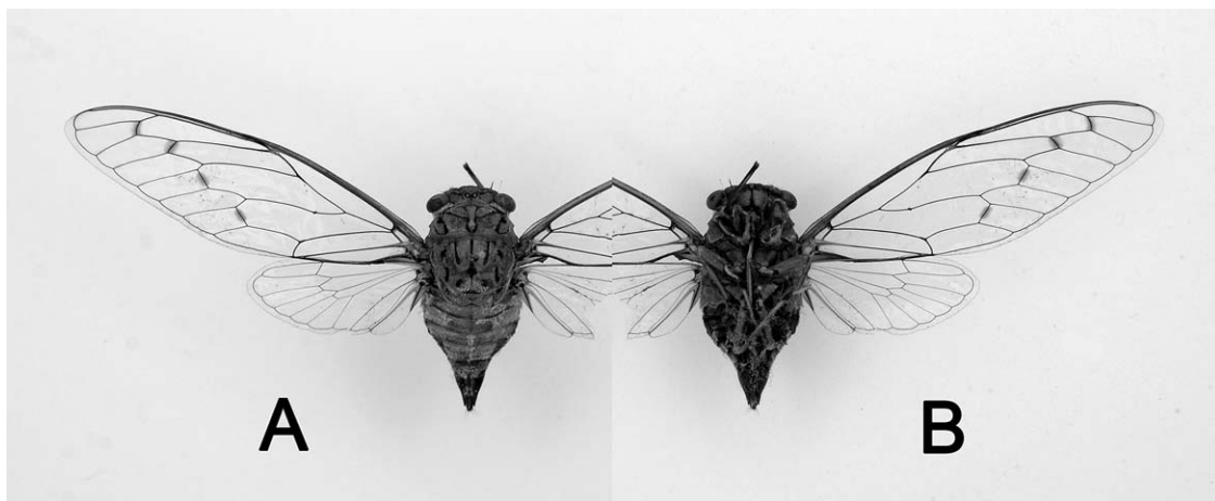
Fig. 2. Dilobopyga aprina Lee, sp. nov. , paratype, female, Sampuraga, Sulawesi, Indonesia, VII-1997. A. dorsal view. B. ventral view.

Pronotum ochraceous. Inner area of pronotum with a pair of central longitudinal fasciae, extending from anterior margin of pronotum to pronotal collar and dilated both anteriorly and posteriorly, a pair of short, oblique branches from middle of the central longitudinal fasciae along paramedian fissures, a pair of fasciae along lateral fissures, of which anterior end broadened, and a pair of curved fasciae along lateral margin of inner area, black to fuscous. Pronotal collar without