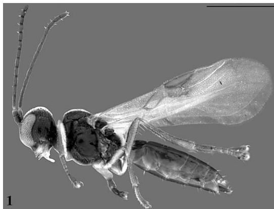
Fig. 1. Holotype of Chaenusa glabra , lateral habitus, scale bar = 500 \mu m.

Diagnosis. —The following combination of characters differentiate C. glabra , Chaenusa bergi (Riegel), and C. rugosa from all other species of Chaenusa : labial palpus 2- or 3-segmented; forewing stigma broad, differentiated from vein R1 distally; forewing vein RS+M absent; forewing first subdiscal cell open; and gonoforceps roughly triangular in lateral view. Other species of Chaenusa have the aforementioned features but in combination with at least one of the following: labial palpus 4-segmented; stigma elongate, distal margin tapering into R1; RS+M at least partially present; first subdiscal cell closed; and gonoforceps boot-shaped in lateral view. Chaenusa glabra is most similar morphologically to the Nearctic species C. bergi and C. rugosa . The labial palpus is 2-segmented in C. glabra and is 3-segmented in C. bergi and C. rugosa . Chaenusa glabra females and males have 10-12 and 12-15 flagellomeres, respectively. Chaenusa bergi has 14-15 and 17-20