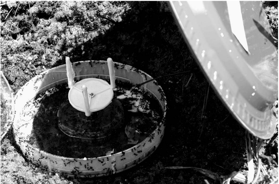
Fig. 1. The fly trap used in this survey was based on traps developed by Puckett et al. (2007) and LeBrun et al. (2008). It consisted of a white tri-stand top coated with Tanglefoot® attached to a slightly larger base by a bolt. The trap was placed inside a large fluon coated Petri dish filed with ants that swarmed into it after being placed into a disturbed mound. Flies were attracted to the disturbed ants and trapped when they landed to rest on the sticky tri-stand.

The trap was placed in the bottom half of a Petri dish (25 by 150 mm). The inside edges of this dish were coated with Fluon® and the Petri dish was settled into a disturbed fire ant mound so it acted like a pitfall trap rapidly collecting 1-10 gm of agitated ants as they swarmed out in defense of their mound. Once trapped in the Petri dish, the ants could no longer retreat into the mound. The ants usually remained in the Petri dish for 2-8 h