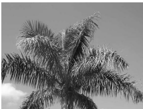
Fig. 2. Frizzling of Royal Palm leaflets due to feeding damage by RPB.

Heavily infested trees based on damage appearance were selected for the study. They were approximately 10 m tall, with an average trunk