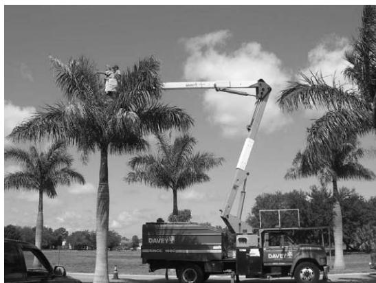
Fig. 4. Sampling of RPB populations in the field utilizing an aerial lift (bucket).

for imidacloprid, the other for dinotefuran/clothianidin. Matrix effects from naturally occurring plant compounds were eliminated from the untreated Check through multiple dilutions until a non-detectable level was reached. The study was conducted from 11 Apr to 20 Jun 2009. During the first half of the study, due to the lack of precipitation, palms were sprinkler irrigated weekly with 2.5 cm water. A total of 24.6 cm of precipitation occurred during the second half of the study.