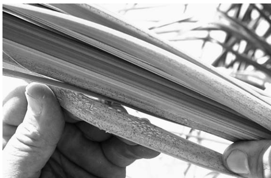
Fig. 1. Close-up of Royal Palm Bugs (RPB) feeding on unfurled Royal Palm leaflets.

day on the leaflet midrib. When nymphs hatch they feed inside folded leaflets and undergo 5 stadia. The duration of the life cycle averages 28 d from egg to adult.