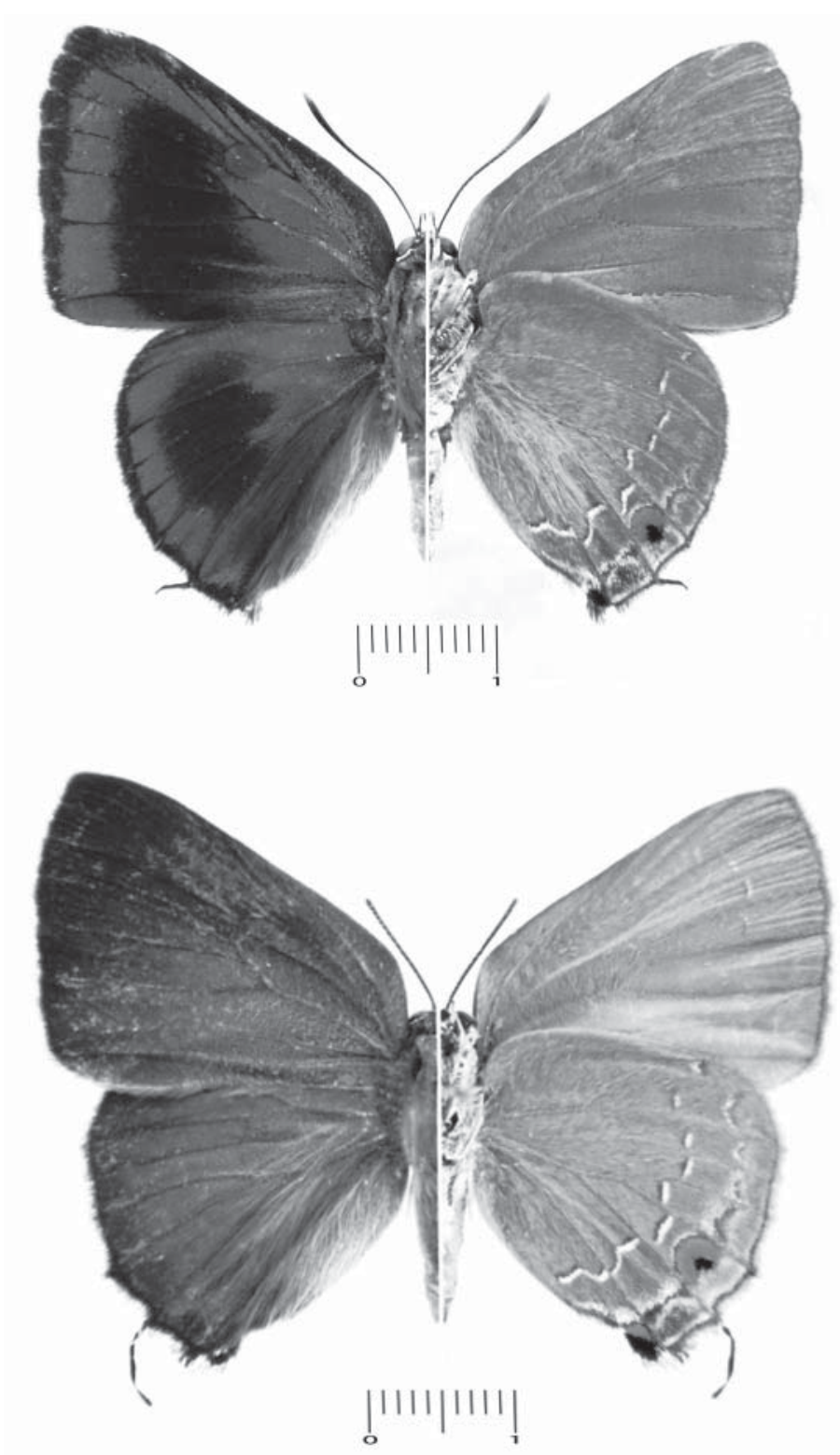
Fig. 2. Male (above) and female (below) of Thepytus echelta (dorsal [right] and ventral [left] views, respectively).