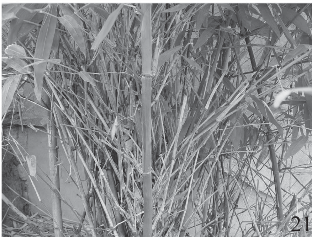
Figs. 20-21. Host plant of Tambinia bambusana sp. nov. 20. View of the area where the specimens of T. bambusana were captured, in Nandan (Guangxi, China) with Dendrocalamus latiflorus Munro; 21. View of the plant, D. latiflorus Munro.