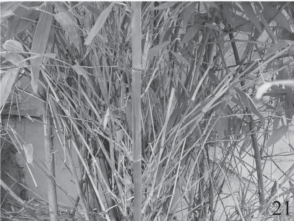
Figs. 20-21. Host plant of Tambinia bambusana sp. nov. 20. View of the area where the specimens of T. bambusana were captured, in Nandan (Guangxi, China) with Dendrocalamus latiflorus Munro; 21. View of the plant, D. latiflorus Munro.