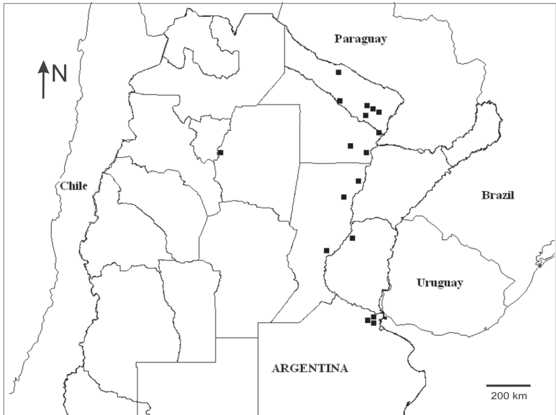
Fig. 11. Map of Argentina with collection sites for Lepidelphax pistiae gen. et sp. nov. (black squares).

Male: Small to medium-sized, predominantly brachypterous forms.