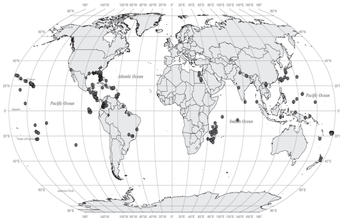
Fig. 2. Worldwide distribution records of Cardiocondyla minutior . Circle = C. minutior record. + = unconfirmed New World ' C. nuda ' record.