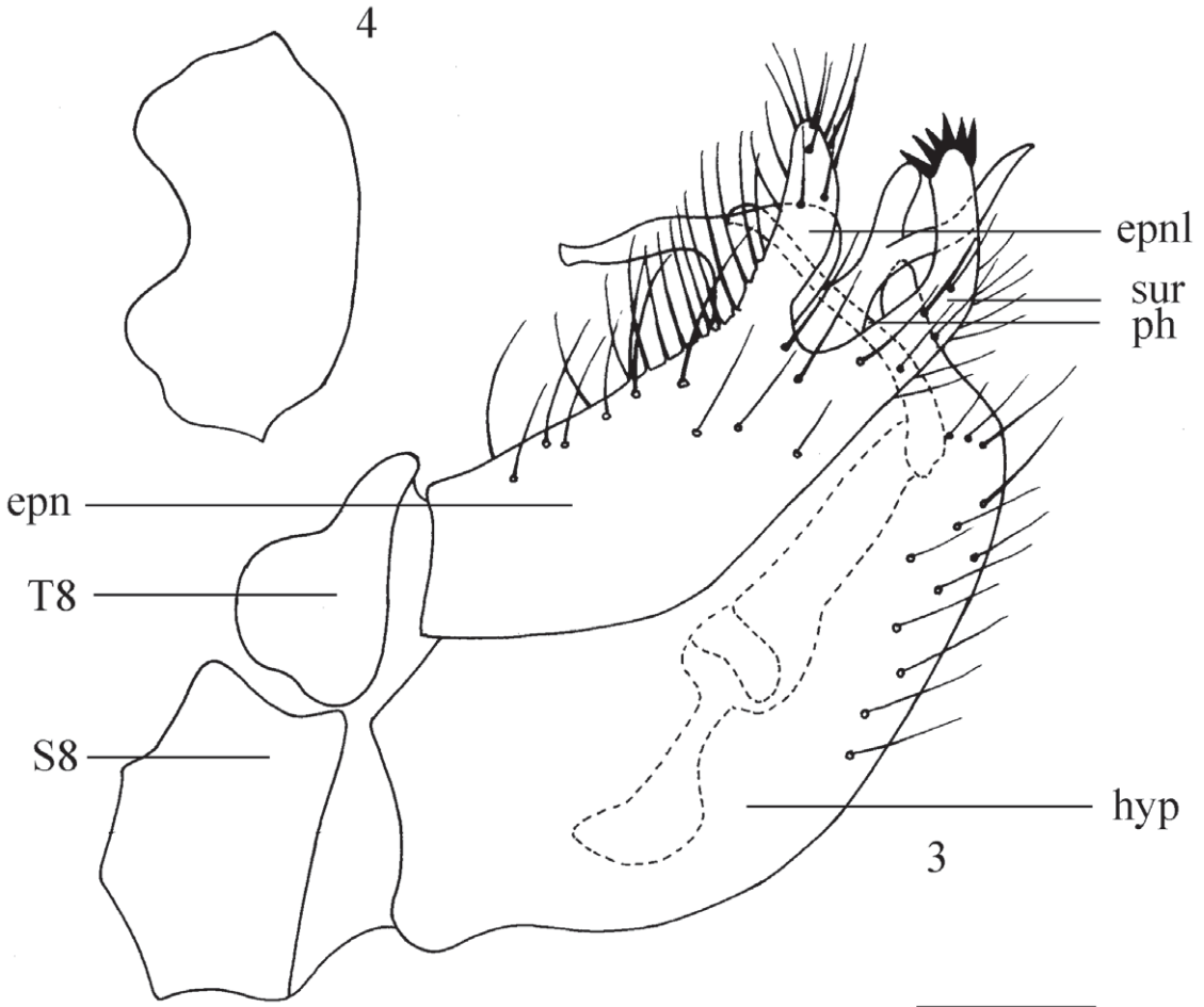
Figs. 3 and 4. Heleodromia (Neoillesiella) orientalis sp. nov. (male). 3. Genitalia, lateral view; 4. Tergite 8, dorsal view. Abbreviations: epn = epandrium; epnl = epandrial lobe; hyp = hypandrium; ph = phallus; s8 = sternite 8; sur = surstylus; t8 = tergite 8. Scale bar = 0.1 mm.

Abdomen black with pale gray pollinosity; hypopygium partly brownish yellow. Setulae and setae on abdomen dark yellow except hypopygium with some blackish setulae and setae.