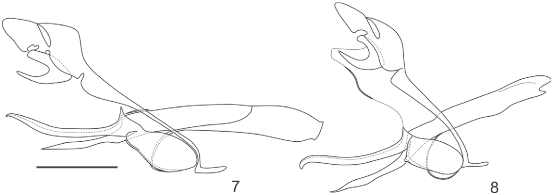
Figs. 7 and 8. Male genitalia of species of Eurybia [Illiger], 1807, lateral view; (7) Eurybia gonzaga sp. nov. , paratype from São Lourenço da Mata, Pernambuco, Brazil (MGCL); (8) Eurybia pergaea from Rio de Janeiro, Rio de Janeiro, Brazil (DZUP). Scale bar = 0.5mm.

thin, long—about half the size of the aedeagus—and posteriorly projected, curved dorsally and distally pointed, base of this projection slightly wider with a small dorsal projection; inferior part of the valva stout, somewhat rounded but irregular shaped, larger dorsoventrally, dorsally lobed and smaller, ventrally more or less rounded and larger; aedeagus cylindrical, almost straight, 3 times longer than tegumen and the uncus combined; anterior opening of the aedeagus small and circular; posterior opening of the aedeagus dorsal and long, about one third the size of the aedeagus; vesica without cornuti.