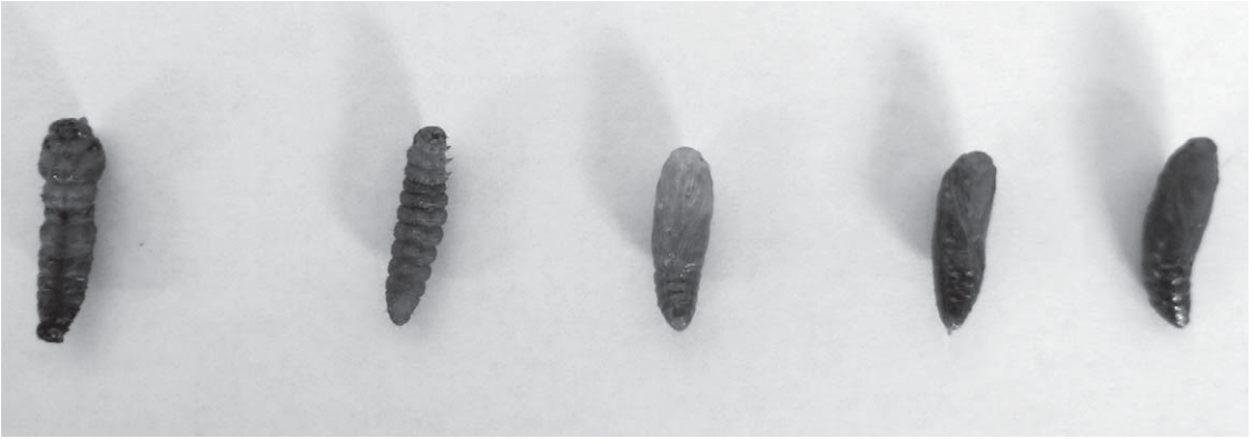
Fig. 2. Pre-pupae and pupae of Melitara prodenialis reared on artificial diet.

sequent generations become adapted to laboratory rearing conditions.