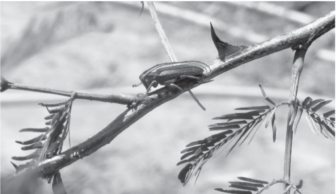
Fig. 1. Oncideres ocularis Thomson, 1868 on a branch of Mimosa bimucronata (DC.) Kuntze.

Weekly visits were made from Dec 2010 to Apr 2011 and Dec 2011 to Apr 2012 to collect fallen branches girdled by this beetle. The diam of the portion where the branches were girdled was measured with a digital caliper with an accuracy of 0.01 mm and its length measured with tape with an accuracy of 0.1 mm. The number of egg-laying incisions was counted per branch. The length of the branch was divided into 5 equal sections (basal, mid-basal, middle, mid-apical and