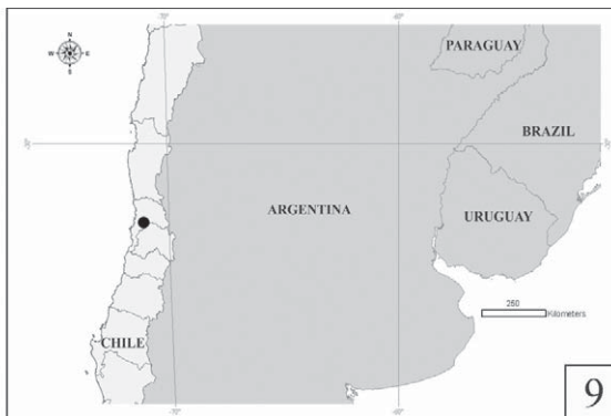
Figs. 8-9. Host fungus and distribution of Cis bilamellatus Wood, 1884 in Chile. 8. A basidiome of Ganoderma australe , used as host. 9. The single distribution record (full circle) in the country.

latus were found inside basidiomes of Ganoderma australe (Fig. 8) developing on live tree trunks of water oak ( Quercus nigra L.), an introduced tree, which formed a grove located on the edge of a country road.