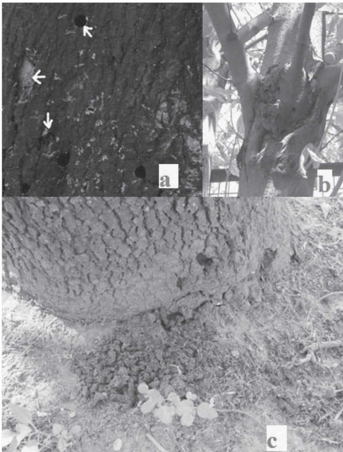
Fig. 3. Indication of damage to a boxelder tree ( Acer negundo L.) caused by Anoplophora glabripennis . a. Oval to round pits in the bark of boxelder ( Acer negundo L.). b. Round holes on the trunk. c. Accumulation of coarse sawdust around the base of infested trees.