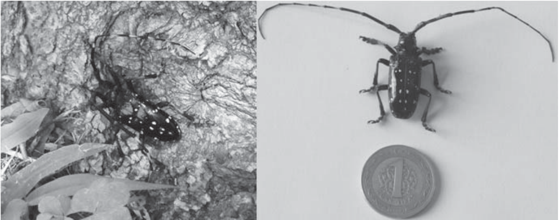
Fig. 2. Adult Asian longhorned beetle, Anoplophora glabripennis .