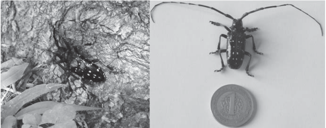
Fig. 2. Adult Asian longhorned beetle, Anoplophora glabripennis .