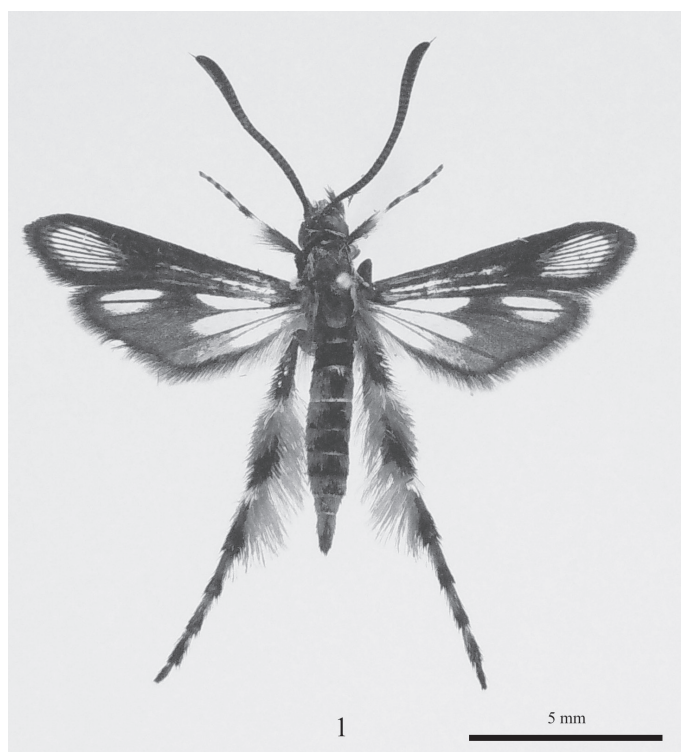
Fig. 1. Male of Pyrophleps bicella Xu & Arita sp. nov.