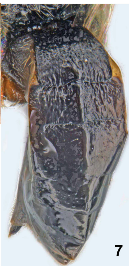
Figs. 2–7. Cotesia dictyoplocae . 2, Body in habitus; 3, head in frontal view; 4, propodeum; 5, wings; 6, mesosoma with metasoma in part; 7, metasoma with propodeum.