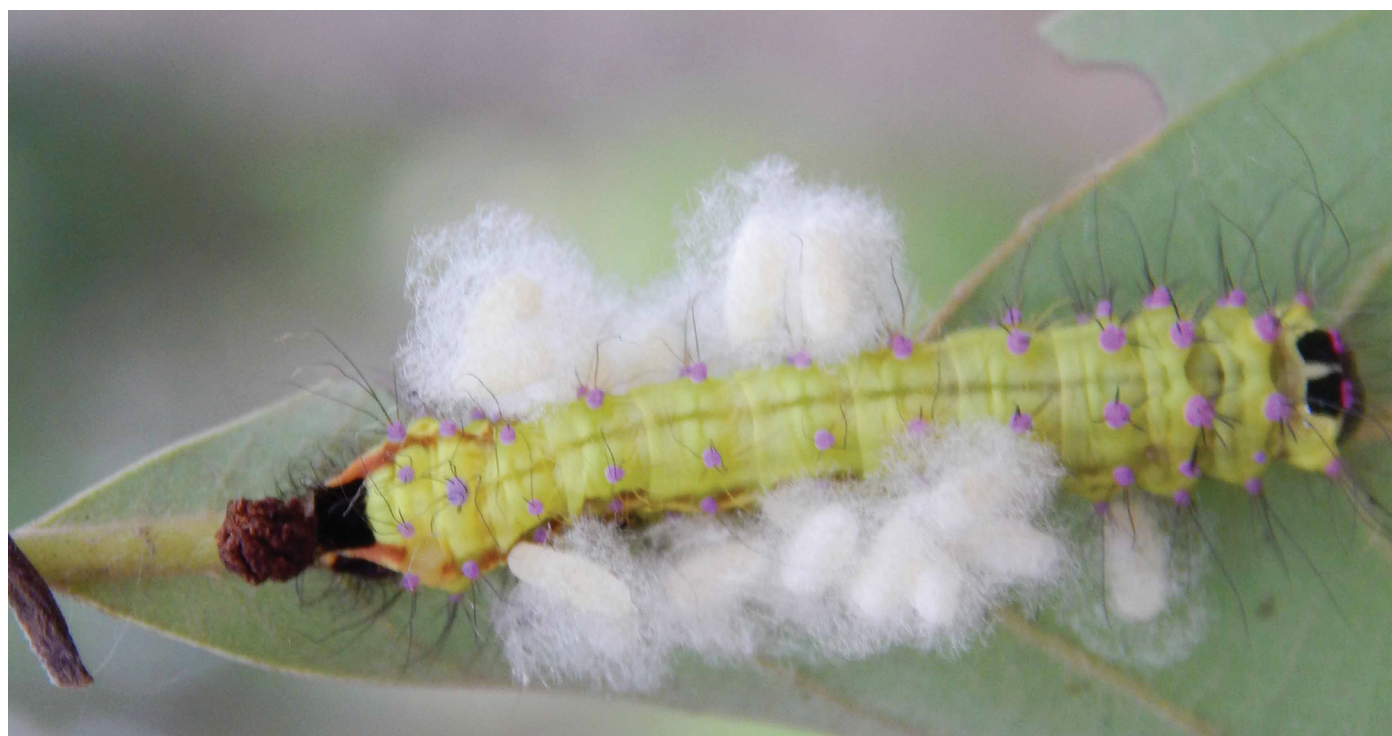
Fig. 1. Parasitized larva of Antheraea assamensis .

alternipes Walker, Brachymeria lasus Walker, Brachymeria lugubris Walker (Chalcididae); Eupelmus sp. (Eupelmidae); Neotoxeumorphia exoristae Narendran (Pteromalidae); Nesolynx thymus (Girault) (Eulophidae); Perilampus nesiotus Crawford (Perilampidae); Pimpla rufipes (Miller) (Ichneumonidae); Trichogramma spp. (Trichogrammatidae); Trichomalopsis apantelectena (Crawford) (Pteromalidae); Xanthopimpla pedator (F.) (Ichneumonidae); and Zelex albiditarsus Curtis (Braconidae) (Noyes 2015; Yu et al. 2012). The following host-plant genera