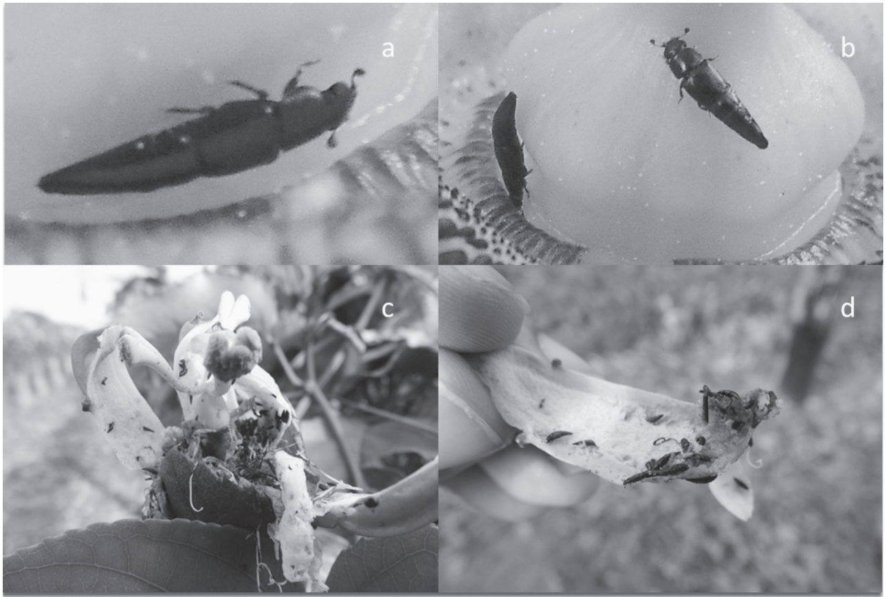
Fig. 1. Adults (a, b) of Conotelus sp. (Coleoptera: Nitidulidae) and damage (c, d) caused by this species in passion fruit flowers ( Passiflora edulis f. flavicarpa ).