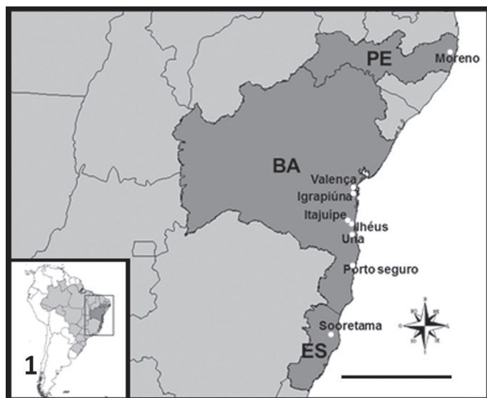
Fig. 1. Map of collection sites. The circles represent the collection points.