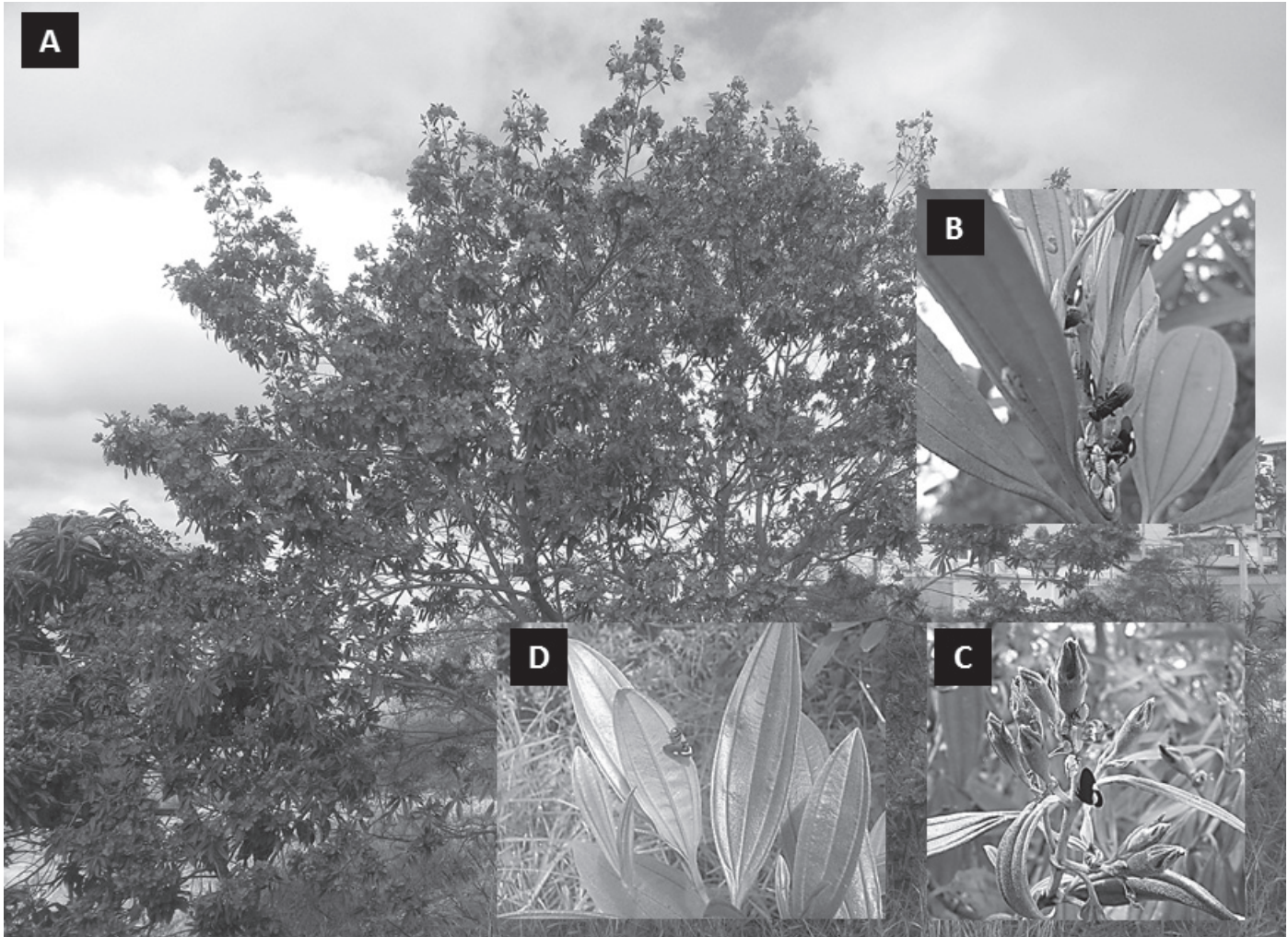
Fig. 1. (A) Tibouchina candolleana (DC.) (Melastomataceae) infested by Membracis juncta (Walker) (Hemiptera: Membracidae), Diamantina, Minas Gerais, Brazil, 2015; (B) Association of M. juncta with Trigona spinipes (F.) (Hymenoptera: Apidae); (C) Nymphs and adult M. juncta on young parts of the plant; (D) Supputius cincticeps (Stål) (Hemiptera: Pentatomidae) attacking M. juncta .

This is the first record of M. juncta feeding on T. candolleana in Brazil. Due to the potential damage to T. candolleana by M. juncta , these plants should be monitored for the presence of these insects.