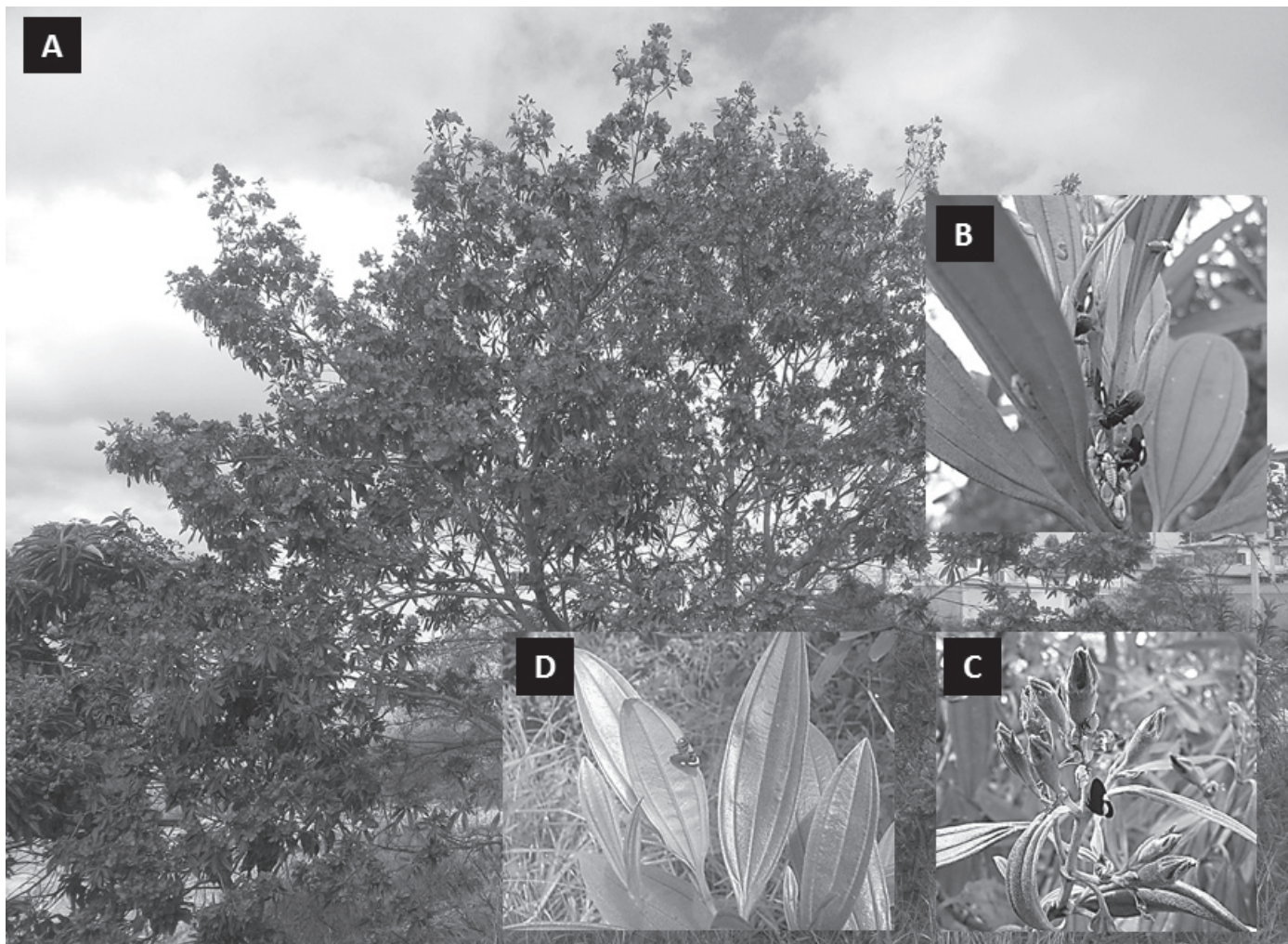
Fig. 1. (A) Tibouchina candolleana (DC.) (Melastomataceae) infested by Membracis juncta (Walker) (Hemiptera: Membracidae), Diamantina, Minas Gerais, Brazil, 2015; (B) Association of M. juncta with Trigona spinipes (F.) (Hymenoptera: Apidae); (C) Nymphs and adult M. juncta on young parts of the plant; (D) Supputius cincticeps (Stål) (Hemiptera: Pentatomidae) attacking M. juncta .

This is the first record of M. juncta feeding on T. candolleana in Brazil. Due to the potential damage to T. candolleana by M. juncta , these plants should be monitored for the presence of these insects.