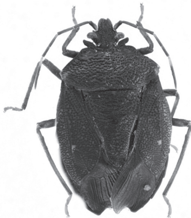
Fig. 1. Adult of Lincus lobuliger (Breddin, 1908) (Hemiptera: Pentatomidae: Discocephalinae) found in Valença, southern Bahia State, Brazil.

During a first visit to collect Lincus spp. in Nov 2015, several specimens were found. In contrast, in a subsequent visit in Jul 2016, fewer stink bugs were found. It is noteworthy that during later sampling there was the frequent presence of adults of a clown beetle, which were collected and identified as the predator Hololepta (Leionota) quadridentata (Olivier) (Coleoptera: Histeridae). The collected beetles were