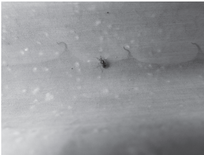
Fig. 1. Damage caused by adults of Caulotops distanti Reuter on leaves of Agave cupreata Trel. & Berger (A), and Agave vivipara L. (B).

thank Consejo Nacional de Ciencia y Tecnología (CONACYT) for providing a Postdoctoral scholarship for the first author at the Facultad de Ciencias Agropecuarias, Universidad Autónoma del Estado de Morelos.