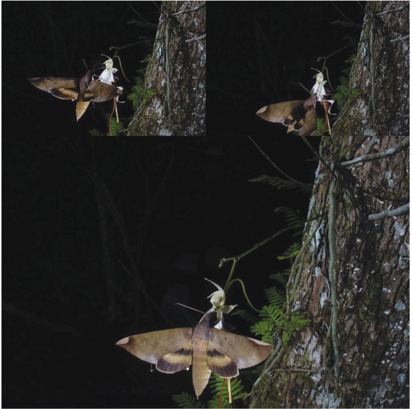
Fig. 2. Stages of proboscis insertion by a female Pachylia ficus (8 Jul 2018, 8:40 PM Eastern Standard Time). Note the close proximity of the insect's head to the column following complete insertion of the proboscis into the nectar spur (lower image).

dates and times of all Lepidoptera that were photographed visiting D. lindenii flowers during the study, with references to figures, if any. Although physical capture of these moths would have been preferable to photographic evidence alone, the high quality images rendered by the digital single lens reflex camera traps allowed for positive identification of most of the larger lepidopterans to the species level. For field-based pollination studies, the camera-trapping technique described herein should provide researchers with a useful tool for studying insect pollination, especially in remote areas. For orchids, which are notorious for having long-lasting flowers and few pollinator visits, this technique also may be especially useful.