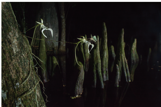
Fig. 9. Seagrass spanworm moth ( Ametris nitocris ) on Dendrophylax lindenii flower (20 Jul 2017, 12:04 AM EST).