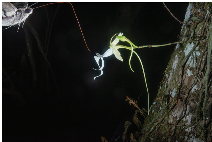
Fig. 8. Suspected Agrius cingulata flying towards Dendrophylax lindenii flower (7 Aug 2018, 12:15 AM Eastern Standard Time).