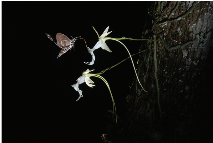
Fig. 4. Dolba hyloeus photographed with Dendrophylax lindenii pollinia at base of proboscis (23 Aug 2018, 8:19 PM Eastern Standard Time).

turnum Jacquin (Orchidaceae). However, we are confident that these pollinia originated from D. lindenii because no other native epiphytic orchid species in the region could accommodate the proboscis lengths of the documented hawk moths, including E. nocturnum . Moreover, the pollinia of Epidendrum orchids typically are more elongated, and have a pronounced stalk leading down to the viscidia (Sheehan & Sheehan 1979). We also did not observe any other orchids in flower in the immediate area at the time of the study. Whether or not the flowers depicted in Figures 1, 3, and 4 were actually fertilized is not known, but several ghost orchids at the site did develop seed capsules both during and after the study. Of particular note is the ghost orchid seed capsule that can be observed in Figures 3, 5, 6, 7, and 11 to 13. This individual ghost orchid is about 22 m away from the ghost orchid depicted in Figures 1, 2, 4, 8, 14, and 15. Additionally, another known ghost orchid that is located approximately 3 m away from the ghost orchid depicted in Figures 3, 6, 7, and 11 to 13 also formed a seed capsule after the study concluded. As such, pollination did take place within the study area, and occurred in close proximity to the ghost orchids where moths carrying pollinia were photographed.