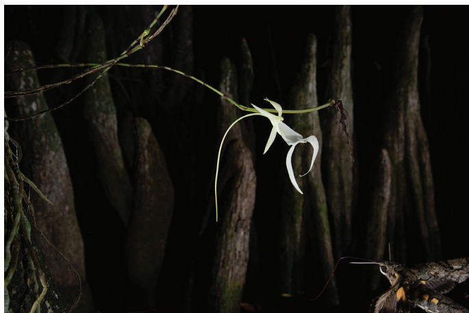
Fig. 7. Cocytius antaeus flying towards Dendrophylax lindenii flower (29 Jul 2018, 8:37 PM Eastern Standard Time).