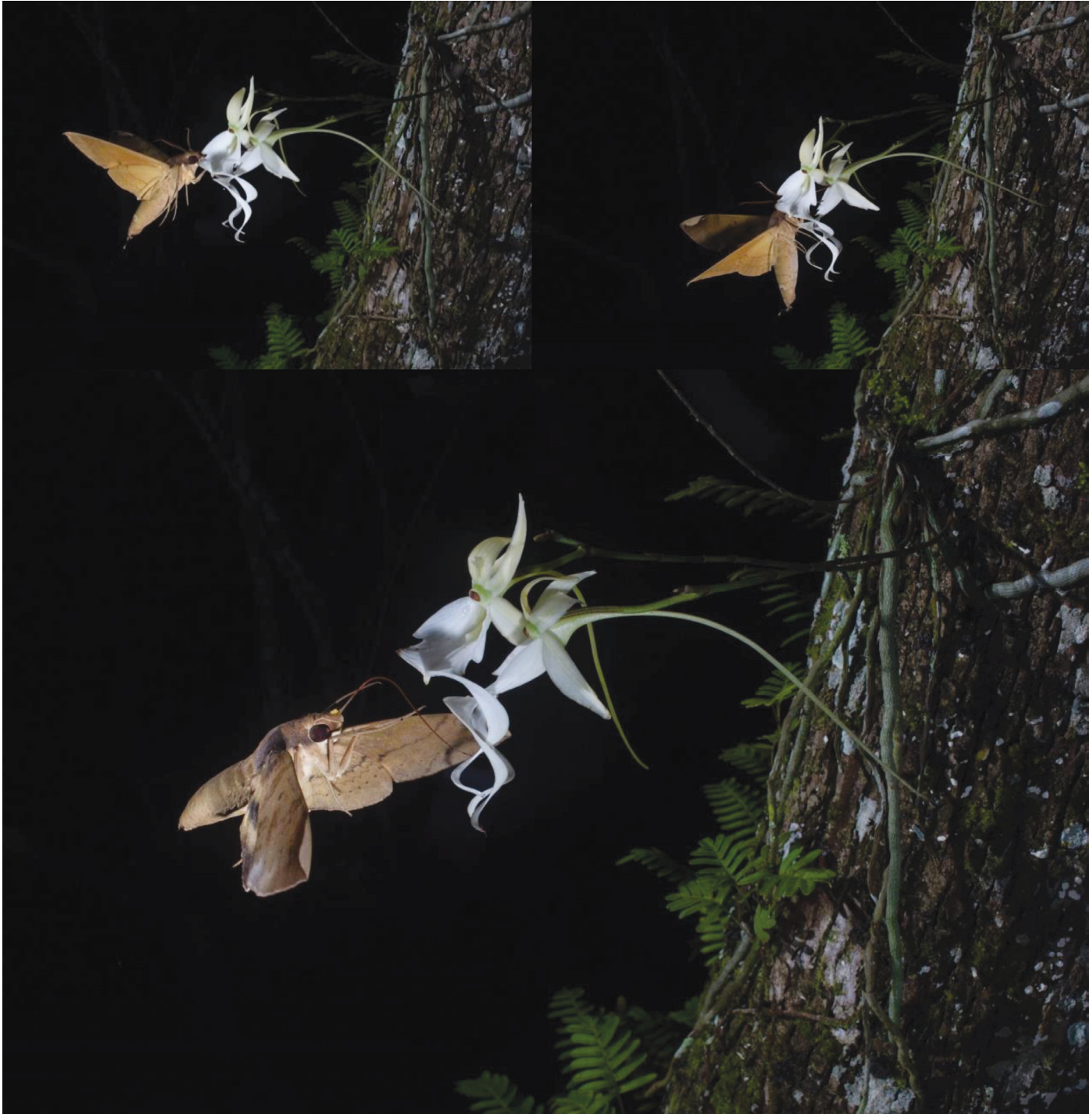
Fig. 1. Pachylia ficus , shown nectaring on Dendrophylax lindenii in top 2 images (3 Jul 2018, 8:55 PM Eastern Standard Time), and carrying pollinia in lower image (5 Jul 2018, 5:43 AM Eastern Standard Time). Pollinia are yellow in color, and can be observed on the moth's forehead, at base of proboscis.

pollinia affixed to the head region at the base of the proboscis (Figs. 1 & 4, respectively). The location of the pollinia on these moths coincides with the orchid's floral column, thereby signifying that these 2 moth species are likely pollinators of D. lindenii . In a second image (Fig. 3), pollinia appear also to be affixed to the proboscis itself in P. ficus . Camera traps captured a single image of a hawk moth flying towards a D. lindenii flower with its proboscis nearly touching a D. lindenii flower on 7 Aug 2018 at 12:15 AM Eastern Standard Time (Fig. 8). Because the photograph lacks sufficient evidence to conclusively identify this moth as A. cingulata , there are some visible characteristics which would indi-