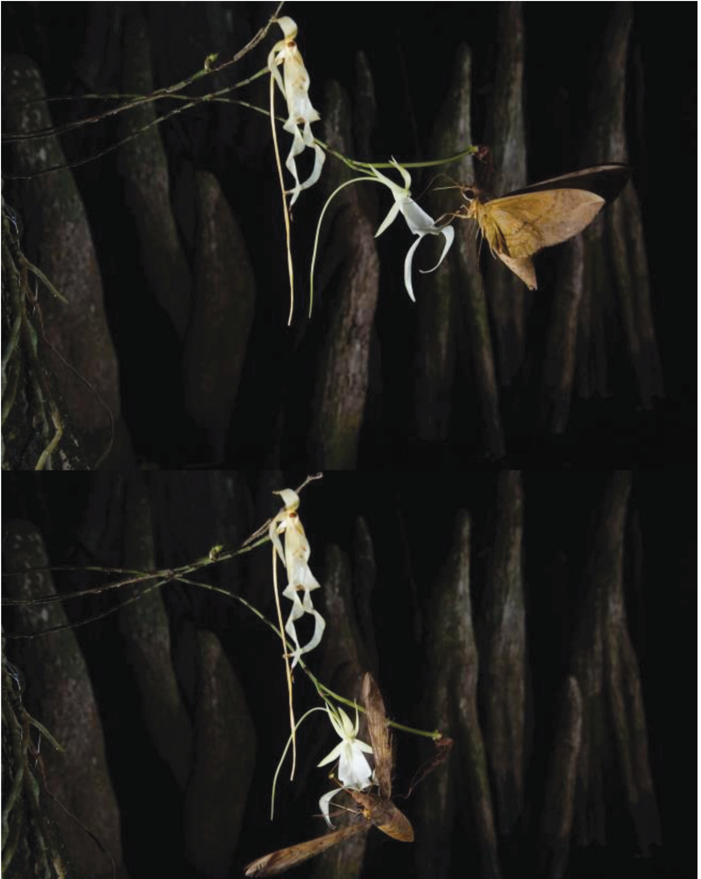
Fig. 3. Pachylia ficus shown inserting its proboscis into the nectar spur opening (top). In the bottom image, pollinia are shown affixed to the proboscis itself (26 Jul 2018, 8:29 PM Eastern Standard Time).