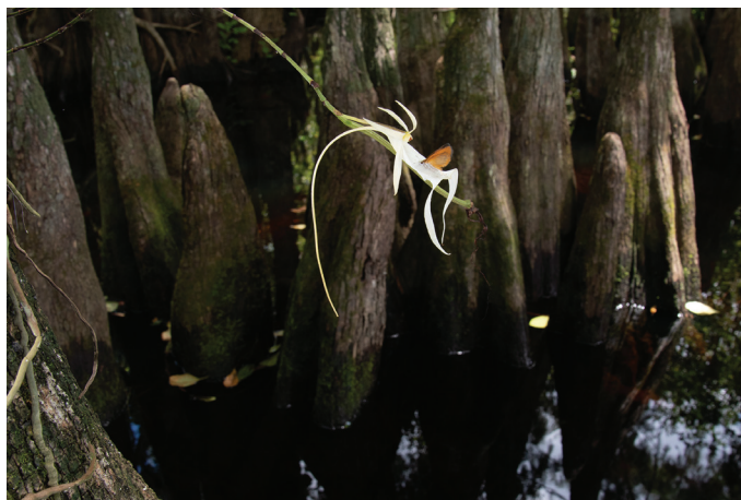
Fig. 11. Unidentified Geometrid moth resting on the labellum of Dendrophylax lindenii flower. The head of the insect is positioned over the concave labellum's upper surface where moisture droplets from dew and rain have been known to accumulate (6 Aug 2018, 2:02 PM Eastern Standard Time).