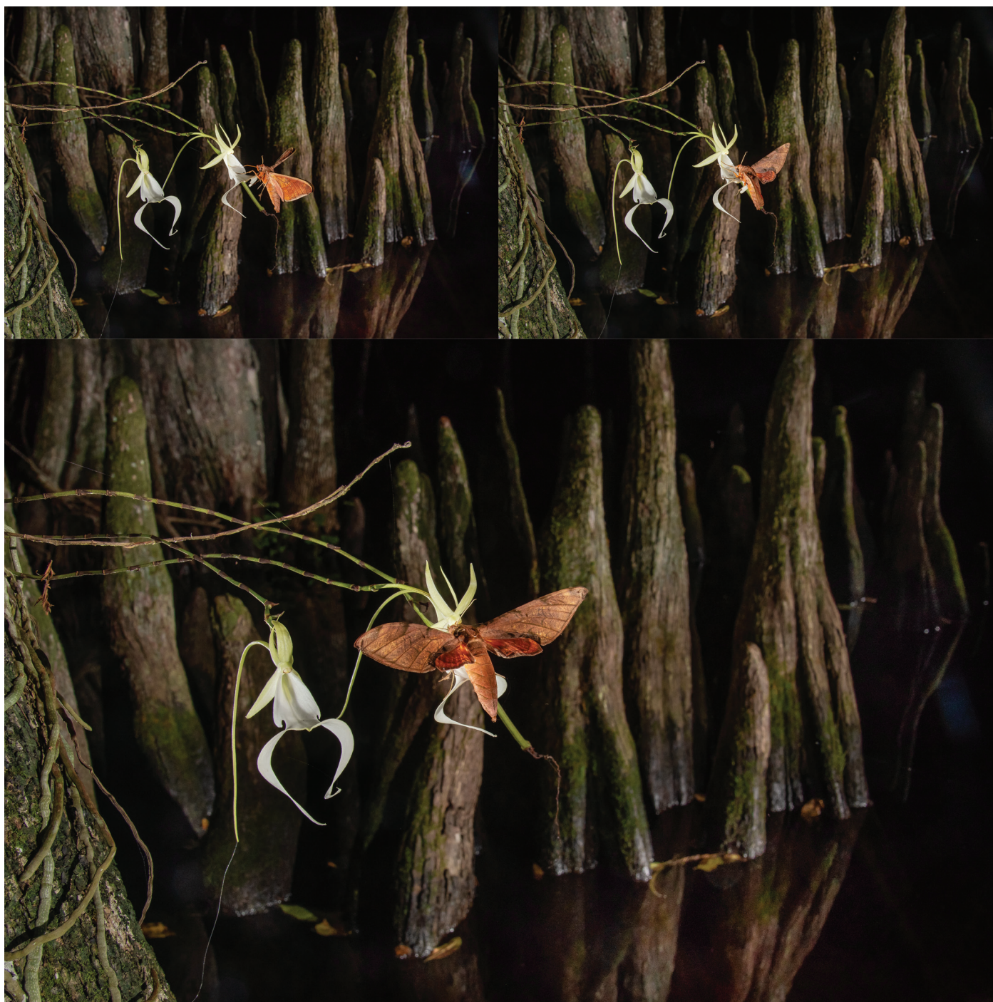
Fig. 6. Photo sequence of Protambulyx strigilis nectaring on Dendrophylax lindenii flower, with proboscis fully inserted into the nectar spur in the bottom image (17 Aug 2018, 10:07 PM Eastern Standard Time).

emphasis on the specialized needs of orchids (e.g., pollinators, mycorrhizal fungi); (2) establishment of ex situ seed and mycorrhiza banks for orchids under immediate threat; and (3) development of orchid restoration techniques. For D. lindenii , all 3 of these actions have been achieved largely due to coordinated research efforts in southern Florida and Cuba during the past decade (see Hoang et al. 2016; Mujica et al. 2018; Zettler et al. 2019; Coopman & Kane 2019). Collectively, all of these efforts have aligned in favor of D. lindenii with 1 important exception – virtually no information existed on the pollination biology of the ghost orchid until now. In addition to the aforementioned actions,