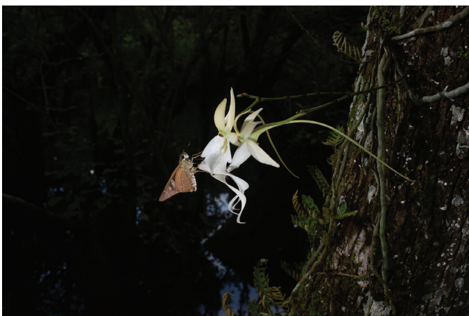
Fig. 15. Brazilian skipper ( Calpodus ethlius ) visiting Dendrophylax lindenii flower (2 Jul 2018, 5:50 PM Eastern Standard Time).