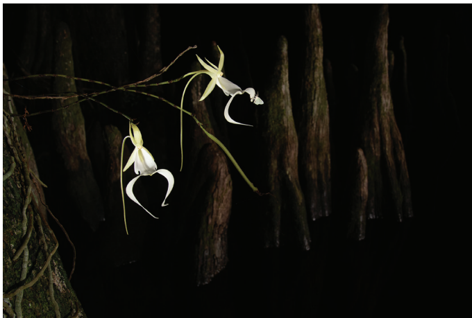
Fig. 13. Unidentified Geometrid moth visiting Dendrophylax lindenii flower (15 Aug 2018, 9:25 PM Eastern Standard Time).