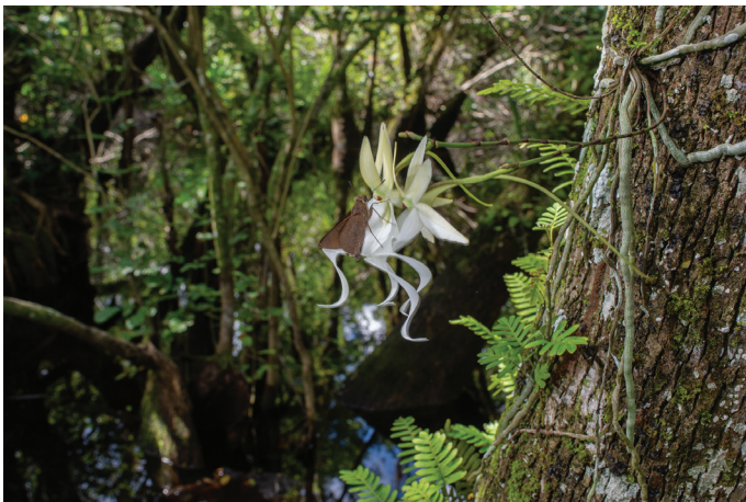
Fig. 14. Monk skipper ( Asbolis capucinus ) visiting Dendrophylax lindenii flower (22 Jun 2018, 10:13 AM Eastern Standard Time).