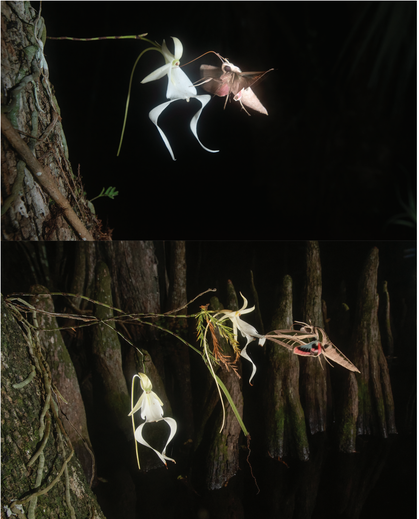
Fig. 5. Top image: Eumorpha fasciatus in the act of inserting its proboscis into the nectar spur, opening just beneath the column of the flower (4 Jul 2018, 2:49 AM Eastern Standard Time). Bottom image: Eumorpha fasciatus flying towards Dendrophylax lindenii flower (2 Sep 2018, 9:33 PM Eastern Standard Time).