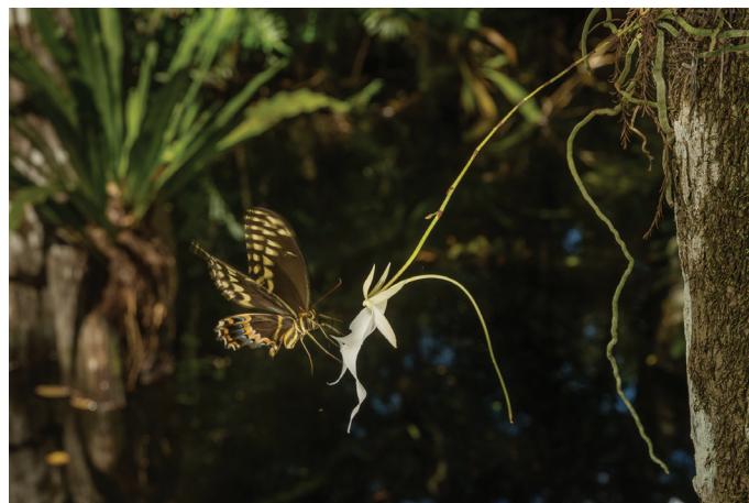
Fig. 10. Palamedes swallowtail butterfly ( Papilio palamedes ) visiting Dendrophylax lindenii flower during daylight hours (9 Aug 2017, 10:59 AM Eastern Standard Time).