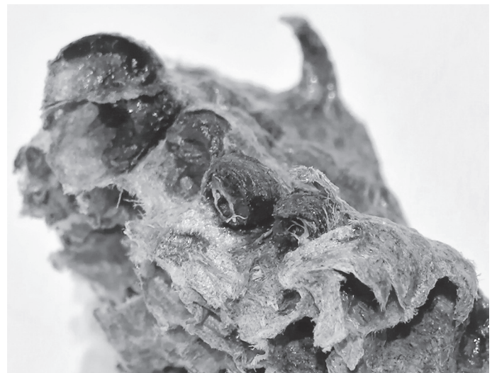
Fig. 1. Meconia in the bottom of the cells of a Polistes dominulus nest.

Nutrition plays a major role in caste determination in many social insects (Hunt et al. 2003). Different castes have different metabolic and nutritional requirements (Judd & Fasnacht 2017). Therefore, the composition and dry weight of meconium are indices of food consumption and energy balance within the colony (Marian et al. 1982). In our study,