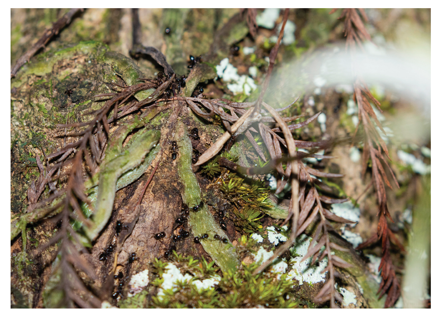
Fig. 2. Crematogaster ashmeadi emerge and return via cavities excavated beneath roots of Dendrophylax lindenii. Individuals make mandible contact with the roots.

Photos, videos, and direct field observations indicated that the ants were patrolling the orchid (Figs. 2, 3). Individuals moved in and out of