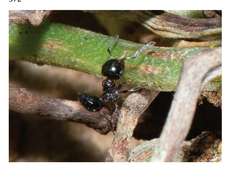
Fig. 3. An individual Crematogaster ashmeadi patrolling the roots of Dendro-phylax lindenii .

a central point beneath the root mass, apparently in a cavity that appeared to have been excavated in the orchid's substrate (Fig. 2). In one case, a spider descended on a bud (Fig. 4) and began affixing a web to the sepals and labellum, possibly lured by the abundance of small prey,