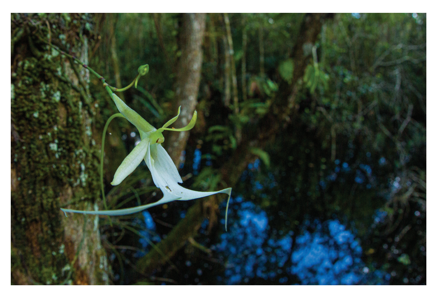
Fig. 1. A ghost orchid, Dendrophylax lindenii , flower and bud in the flooded forests of Fakahatchee State Park, Florida. One of 2 individuals observed having an association with Crematogaster ashmeadi . A mosquito is seen resting on the labellum of the flower.

Observations were conducted in the Fakahatchee Strand Preserve State Park in Collier County, Florida. The lowest part of the Everglades and Big Cypress basins in elevation, Fakahatchee is a unique subtropical strand forest, characterized by slow-flow, seasonally flooded sloughs that are dominated by pop ash ( Fraxinus caroliniana Mill.; Oleaceae) and pond apple ( Annona glabra L.; Annonaceae) the primary hosts in Florida for the epiphytic D. lindenii (Fig. 1). The presence of royal palms and bald cypress adds to the distinctiveness of these forests, as this sympatry is not found anywhere else in the world. Fakahatchee contains the highest diversity of orchids (> 49 spp.) and bromeliads in the USA.