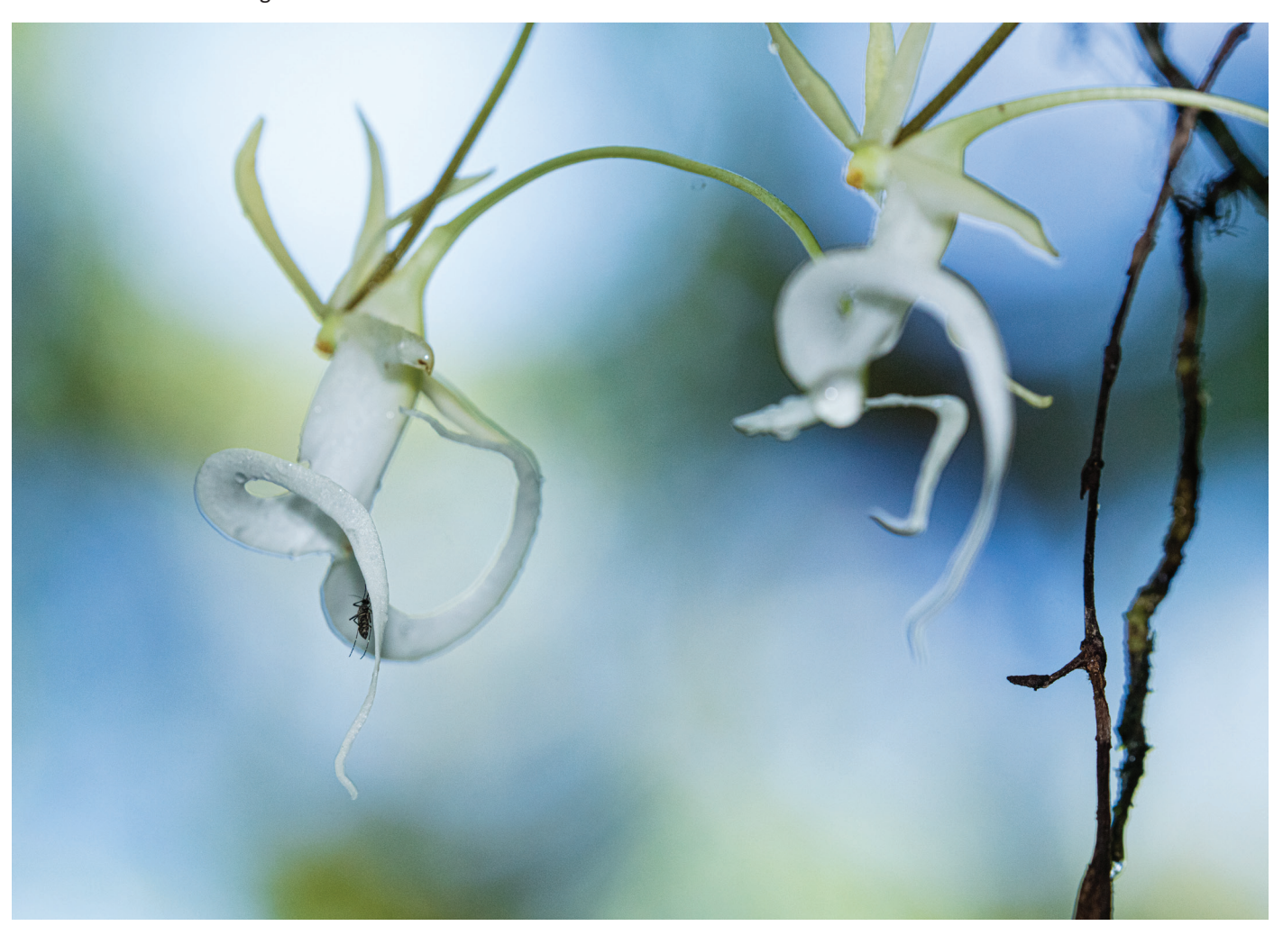
Fig. 5. A mosquito, Aedes taeniorhynchus , rests on a Dendrophylax lindenii flower. This is a common occurrence that may indicate insect attraction to volatile compounds emitted by the orchid, and also potential prey for ambush predators on its flowers.

in situ (Jones et al. 2017). In a floristic study of the Everglades of southern Florida (Koptur 1992), 9% of species (78 of 851 spp.) were reported to contain extra floral nectaries. Although D. lindenii was not one of the 9 orchid species identified with extra floral nectaries, that study did not state if this orchid was assessed. However, we believe that this species was not present because the primary focus of investigations were carried out in Everglades pineland and sawgrass prairie habitats rather than flooded forests characteristic of D. lindenii in the Big Cypress Basin. Indeed, Hoang et al. (2016) dissected numerous D. lindenii for anatomical studies that were germinated from southern Florida seeds and did not identify extrafloral nectaries on the stem, root, or leaf primordia (N. H. Hoang personal communication). The study of extra floral nectaries within flooded forest habitats remains limited (Koptur 1992). Based on observations of mandible prodding of roots by ants in our study (Fig. 3), root masses warrant further inspection for possible secretions. As stated earlier, it is possible also that volatiles, rather than extra floral nectaries, play a role in attracting ants to this orchid (Willmer et al. 2009).